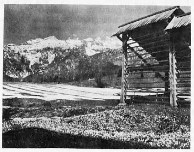
Pomlad na Uskovnici nad Bohinjem