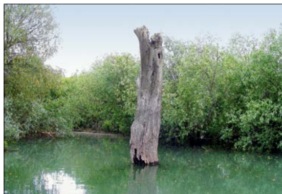
Figure 4: Nesting hollow used by Goldeneye Bucephala clangula in an old willow Salix sp.

Another species whose nesting was recently reconfirmed in the Danube Delta is the Smew. According to classical Romanian ornithological literature, the Smew nested in the floodplains of the lower Danube to the east of former Lake Greaca, and in Dobrogea (LINȚIA 1955, VASILIU & ȘOVA 1968). In the next few decades it was considered only a migratory and wintering species (TĂLPEANU 1970, MUNTEANU 1998). Wintering flocks converge on the larger lakes in the Delta and in the lagoons and, in times of exceptional frosts, along the ice-free parts of the coast and the Danube. Large flocks arrive in the Delta in October and leave by the end of March/beginning of April; but in recent years more and more observations have been from the nesting period, so far without accurate data (MUNTEANU 2004, BOTNARIUC & TATOLE 2005, CNDD 2015D). From the first records of the reappearance of Smew as a breeding species, the population for Romania was estimated to be 0–5 pairs in 1996–2002, and 10–15 pairs in 2000–2012 (BIRDLIFE INTERNATIONAL 2004, EIONET 2008–2012B). As in the case of the Goldeneye, data on the nest locations and on the exact distribution were