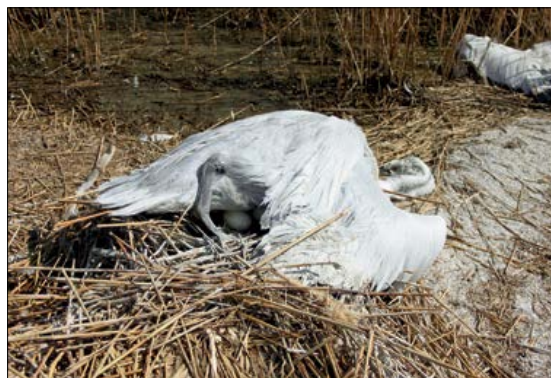
Figure 3: Dalmatian Pelican Pelecanus crispus dead on the nest

Danube and a few small inland lakes; nesting sites were also recognized along the continental coastline of the Razim-Sinoie lagoon system (VASILIU & ŠOVA 1968, TĂLPEANU 1970, PAPADOPOL 1976, WEBER et al. 1994, MUNTEANU 1998, CIOCHIA 2001). Occasional breeding has also occurred elsewhere (CUZIC 2004, BOTNARIUC & TATOLE 2005). The presence of the species in the Danube Delta usually rests on sparse observations of solitary individuals or small groups, with no evidence of nesting. Ruddy Shelduck nesting in the actual Danube Delta was first confirmed in the summer of 2015 on the salt lake situated between the villages Letea and C. A. Rosetti, on Letea Dune. In early June, conservation ranger Lupu Costel reported a family of Ruddy Shelduck with 12 ducklings, which he had repeatedly observed. The area further held three Shelduck Tadorna tadorna families, with 3, 4 and 7 ducklings respectively. On 25 Jun we secured a series of confirmatory photographs with the female and ducklings.