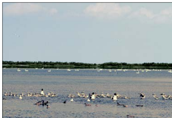
Figure 7: Pallas's Gull Larus ichthyaetus nursery in the water (photo: B. J. Kiss)

Slika 6: Odrasli ribji galebi Larus ichthyaetus varujejo "vrtec" mladičev na obali (foto: B. J. Kiss).