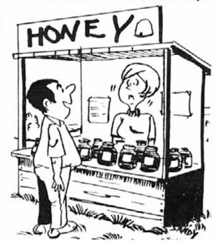
"Je tajnost, ali pa mi smete povedati kako pripravite Vaše čebelice, da znesejo med v vse te stekleničke?" (ABJ)

Ko je pri nas še vladala tlaka in je bil med edino sladilo, ker sladkorja še poznali niso, in so bile voščane sveče najimenitnejša razsvetljava, je Valvasor že poročal: "Med uporabljajo za jed, za zdravilo, vosek za sveče, obliže, zdravila, za izdelovanje