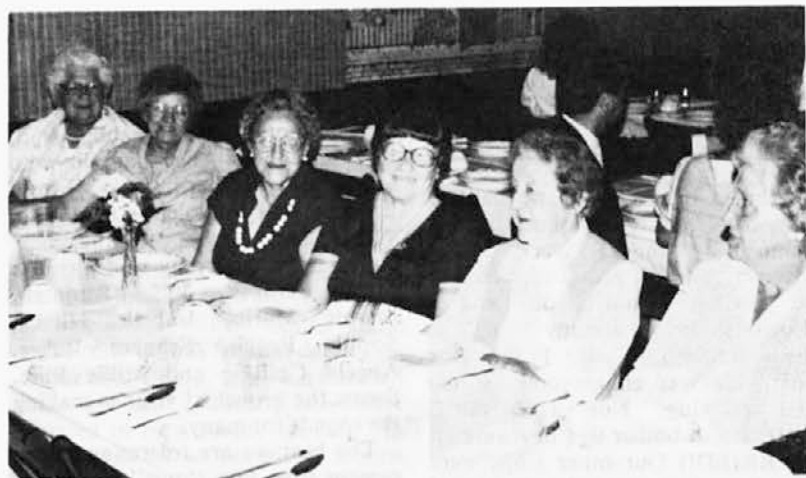
Guests from Br. 14, Euclid joined the festivities at Br. 41.