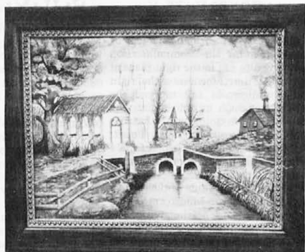
Church along the river