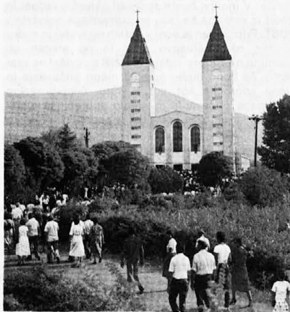
Župniška cerkev, Medjugorje