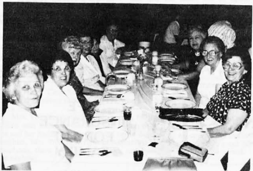
Guests from Br. 41, 10, 14, 32 and 50 at Member of the Year party of Br. 41 held in Collinwood.