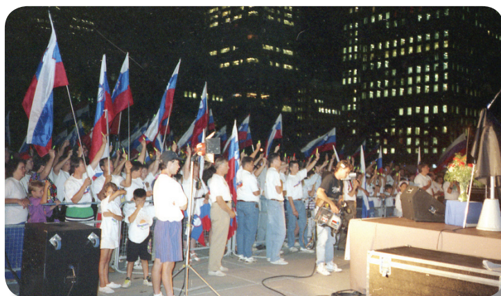
Candlelight Vigil at Nathan Phillips Square, Toronto. Notice the new Slovenian flags at all of the demonstrations. These were hastily sewn by volunteers.