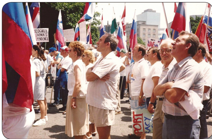
At Queen's Park, Toronto