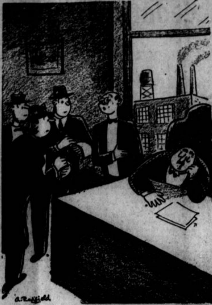
... and he further proposes that union dues go into the company treasury—uh, for safekeeping."

The leaders of the American Legion should crack down on these un-American demonstrations. "Super-patriots" are pests Americans will not tolerate.—(LABOR)