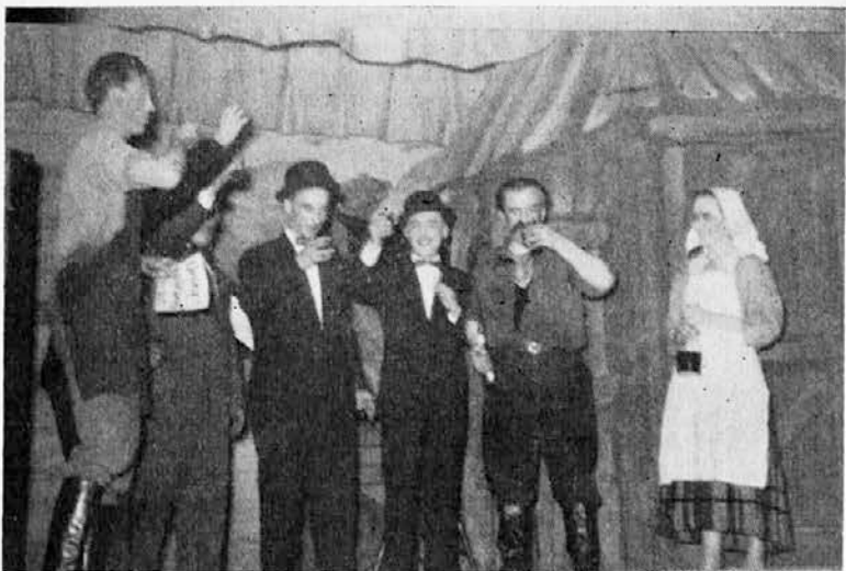
Zaključni prizor iz spevoigre „Kovačev študent“. Vinški bratci obišejo Janeza, ki je zamenjal knjige za kovaški meh. Vsi so zadovoljni, tudi oče in mati, ter izpraznijo še enkrat kozarce „na zdravje vseh dobrih ljudi!“