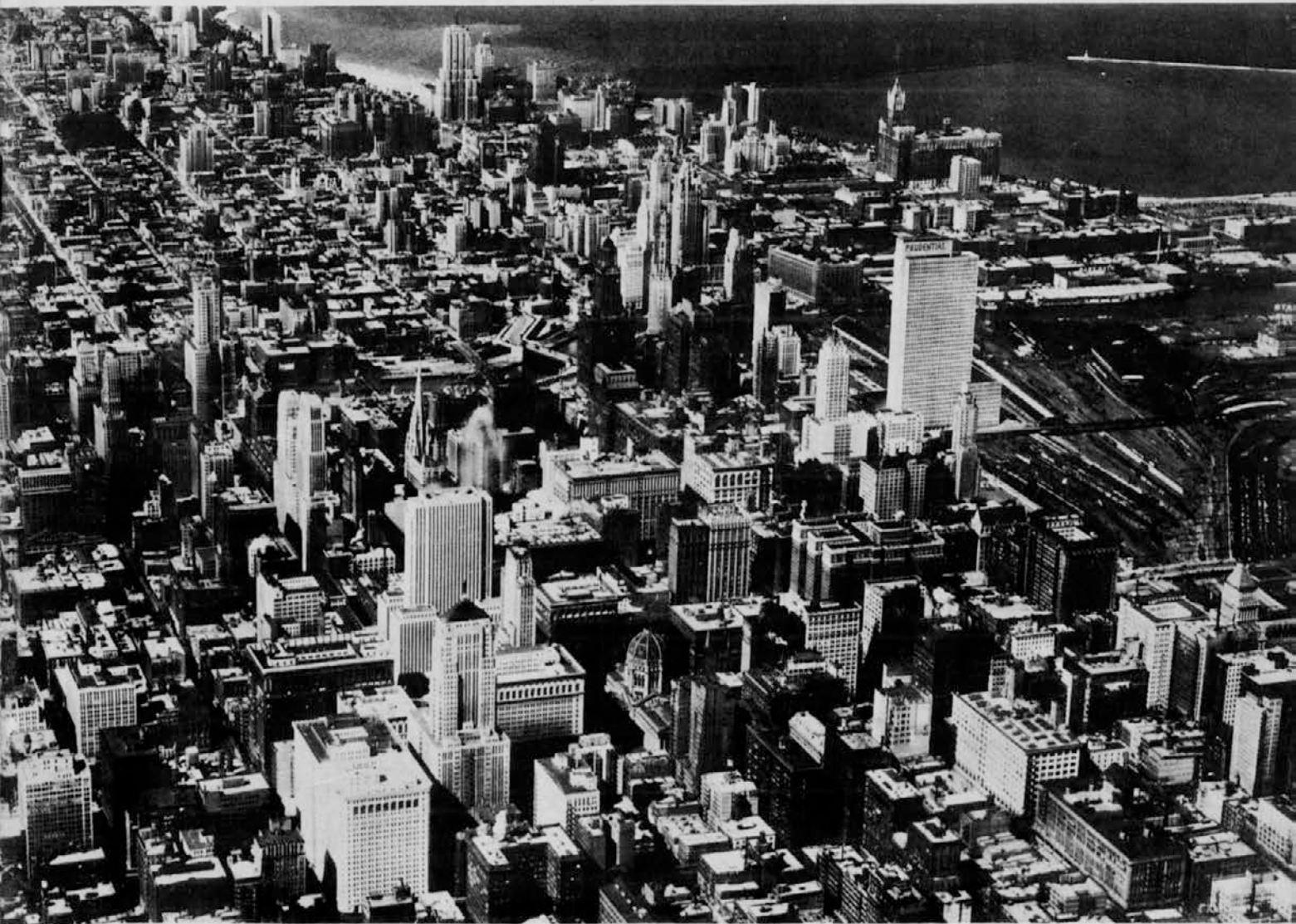
Aerial View of Chicago's Skyscrapers.