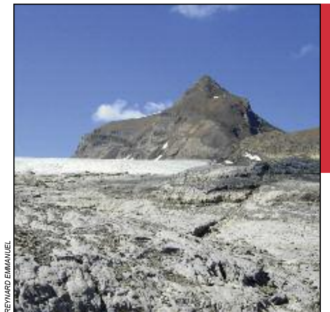
Tsanfleuron glacio-karstic area, Switzerland.