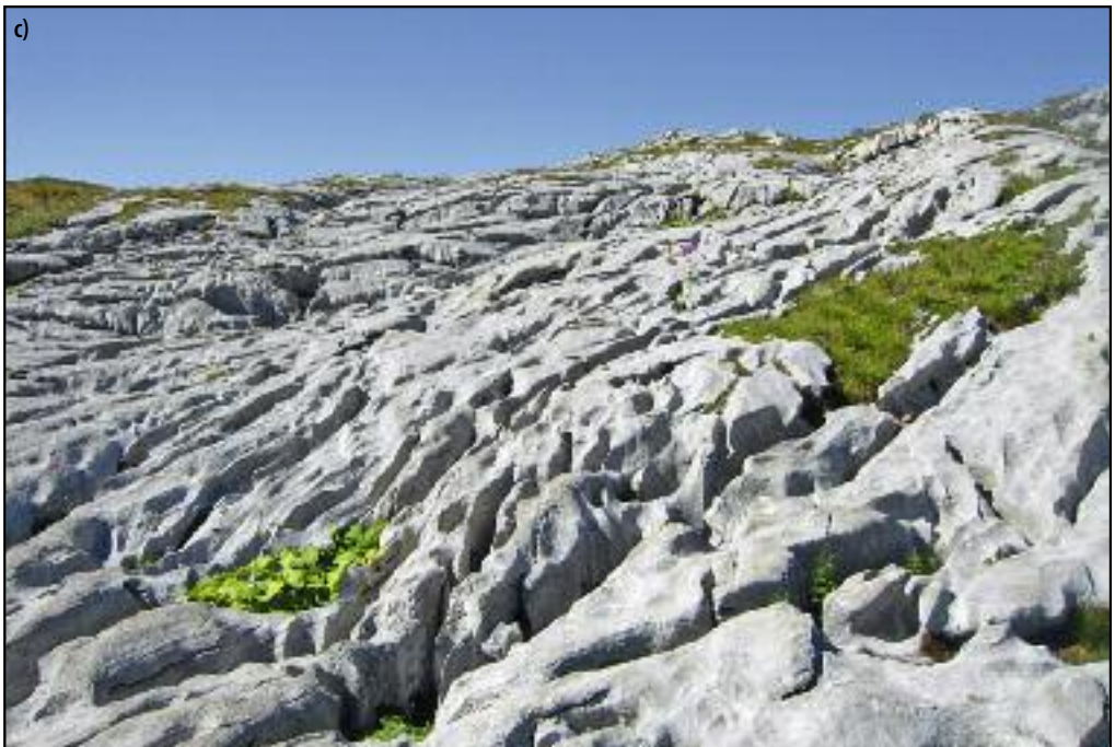
Figure 3: (a) A view of the glacio-karst of Tsanfleuron. (b) The part of the karren field deglaciated since the beginning of the Holocene. (c) A detail of karren fields.