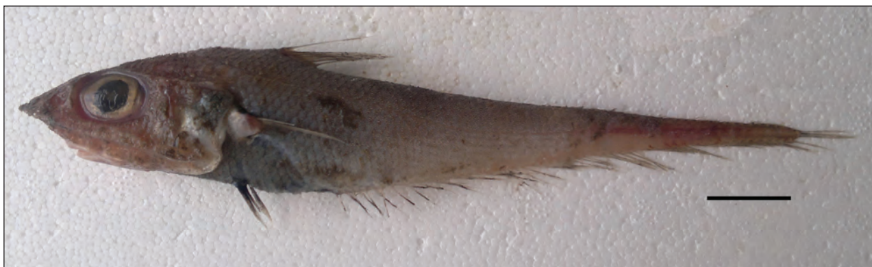
Fig. 2: The hollowsnout grenadier Coelorinchus caelorhincus captured off the Syrian coast (specimen referenced 2266 M.S.L, in the Ichthyological Collection of Tishreen University, Syria); scale bar = 20 mm.

Sl. 2: Grenadir Coelorinchus caelorhincus , ujet blizu sirske obale (osebek označen s kataloško številko 2266 M.S.L, v ihtiološki zbirki Univerze v Tishreenu; merilo = 20 mm).