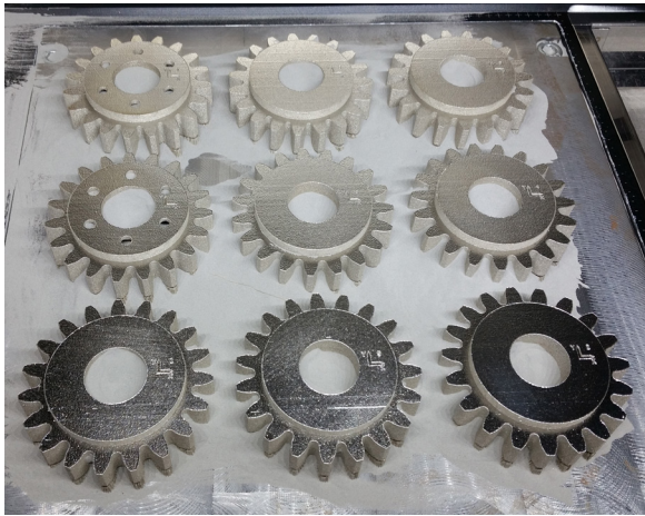
Fig. 1. A set of gears on the building platform after the melting process using the DMLS method

Gears were modelled in several variants of allowance thickness, which resulted from the assumed technological process of gears and compensation for material shrinkage. Prior to melting, pre-production was performed, involving the use of the specialist software EOSTATE Magics RP by Materialise. This stage included preparing the model for the process and setting up the machine according to the manufacturer's recommendations. The preparation of the model included data processing (creating an .stl file of specific accuracy), determining the model's suitable location in the workspace and designing appropriate anchors.