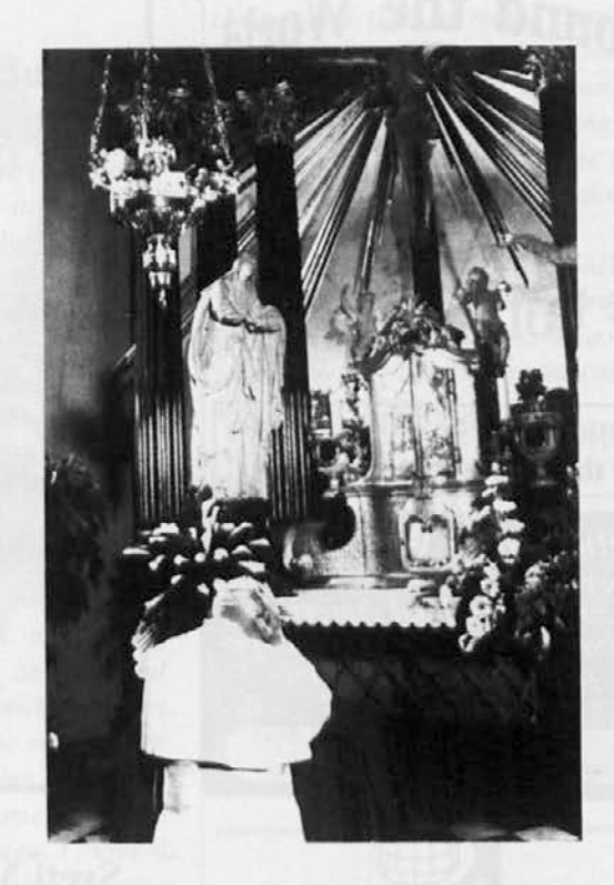
Papež moli na slomškovem grobu v mariboru

Slovenian Women's Union 431 No. Chicago Street . Joliet, IL 60432