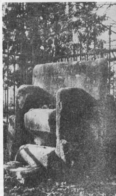
Duke's throne at Gosposvetsko polje

and crowned, and took a seat on a stone throne (still preserved) swearing to democratically uphold the rights of the people during his reign. This site is located in present day Austria. Slovenians lived in this region from the 7th Century. Thomas Jefferson, in the formation of his contractual theory and the writing of the American Declaration of Independence in 1775 is said to have been influenced by the Slovenian democratic process which was written in the very earliest history of this European region.