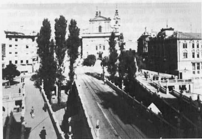
Franciscan Church and Tromostovje (Three Bridges) are the center of Ljubljana.

Our hotel in Ljubljana was just a few steps away from the history and magnificent Franciscan Church, dedicated to the Annunciation of Mary. It stands just at the center of the city on Prešeren Square and dates from 1646-60. We