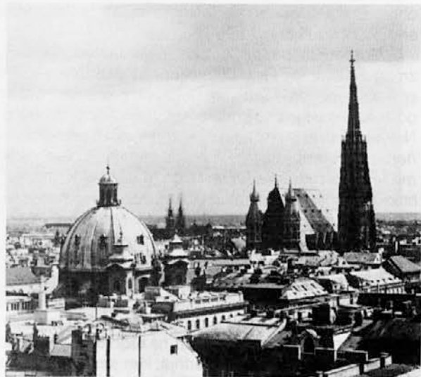
«Dunaj, mesto mojih sanj...»

Od Mauerja sva se vlekla naprej kakor sva vedela in znala. Tedaj so se iz teme nenadoma pojavile moške postave. Glasni »stoj!« naju je prestrašena