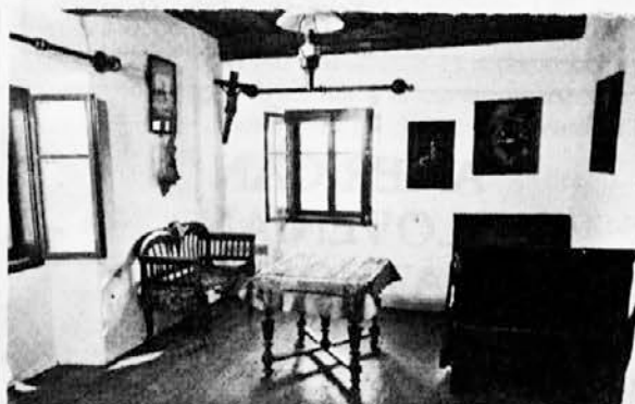
Mala Vas is the place where Bishop Baraga was born. Here his birth room is kept neatly and respectfully.