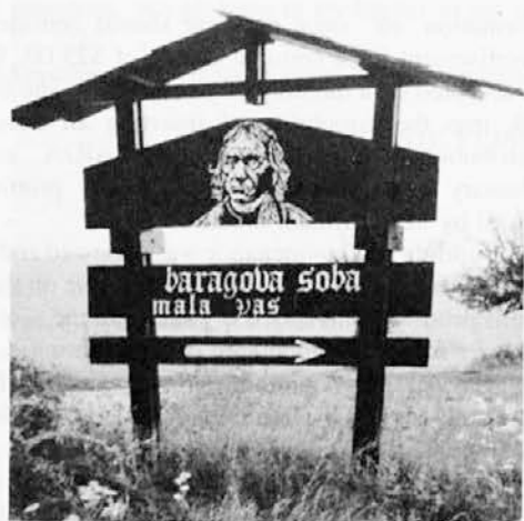
This sign greets you at Mala Vas farm at the entrance of the farm house.