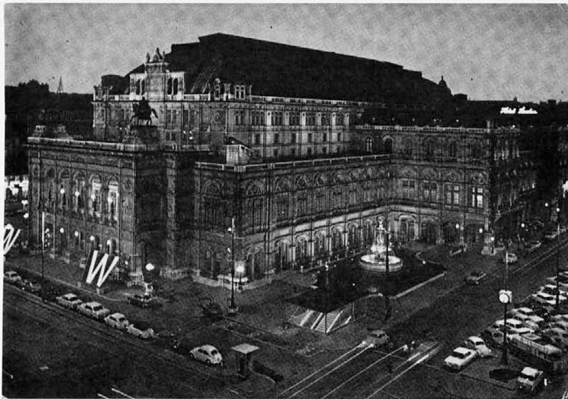
Slavna opera na Dunaju

sem vzel to, kar so lahko zgrabile roke. Tako sva jo hotela popihati.