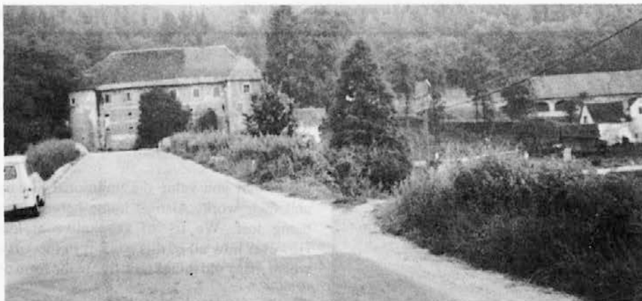
When Bishop Baraga was two years old, the family moved to this "castle" at Trebnje.