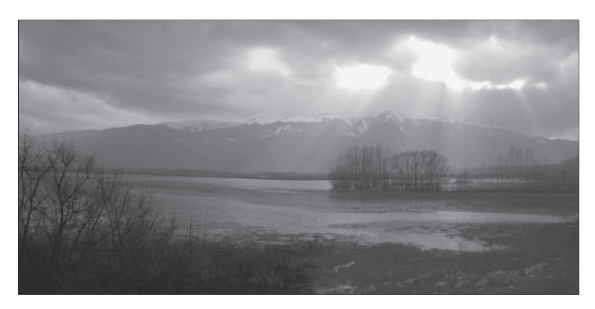
Figure 2: View from point 21 (compare Figure 1) over the flooded NE part of Livanjsko Polje with large reed beds at the foot of the Dinara Mountain bordering Croatia