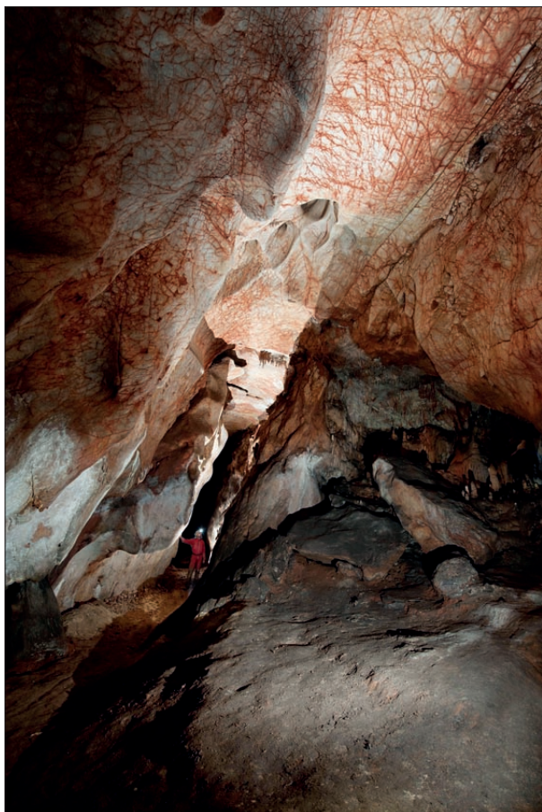
Fig. 2: Ceiling channel in the Dome of Mysteries, Domica Cave.

that the evolution of ceiling channels is mostly dependent on mechanical erosion by flowing water rather than limestone dissolution (according to recent studies, the rocky forms representing the paragenesis developed by rock dissolution; e. g., Slabe 1995; Farrant & Smart 2011). Based on the forms of ceiling channels and rest of river deposits, Roth (1937) expected that the Domica Cave was once nearly completely filled by alluvial deposits loaded by allogenic streams. The water stream pressed up to the ceiling “has to enlarge its way up by rock erosion in cave ceiling” forming “the passage with vaulted cross-section” remaining after the exhumation of cave sediments (p. 131 in the Czech text, p. 39–40 in the French summary; Figs. 2 and 3). Ceiling channels in the Domica Cave developed in two levels and served as the principal argument in the interpretation of Domica Cave evolution.