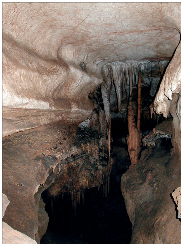
Fig. 3: Ceiling channel in the Meander Passage, Domica Cave.