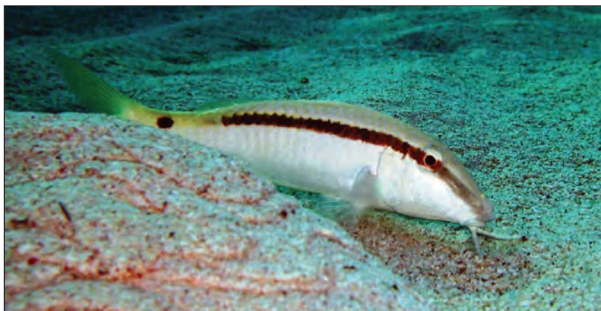
Fig. 2: Parupeneus forsskali (underwater photograph by Hédi Zaouali).