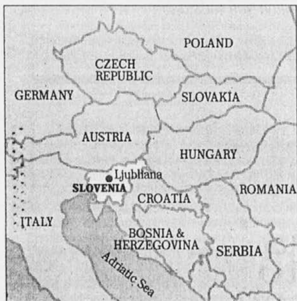
SOURCE: Northeast Ohio Data and Information Service at Cleveland State University