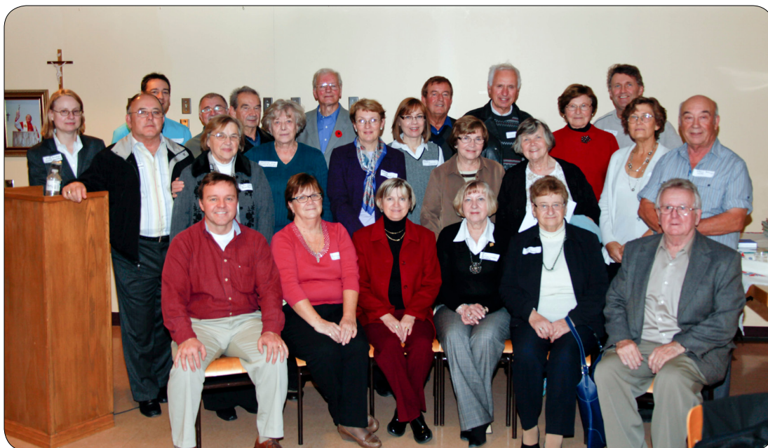
Skupinska slika udeležencev na konferenci "Pridružite se nam"