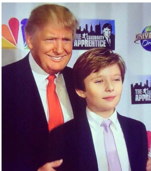
Donald in Barron

Donald Barrona ni nikoli previjal, je pred leti priznala Melania, hkrati pa poudarila, da oče in sin skupaj preživljata veliko prostega časa. Tako kot oče ima tudi Barron okus za drage stvari, pa naj bodo to obleke, helikopterji in letala ali pa obrazne kreme. Melania je v pogovoru za ABC News pred leti povedala, da Barron vsak večer po kopeli uporablja njeno vlažilno kremo, katere glavna sestavina je kavjar.