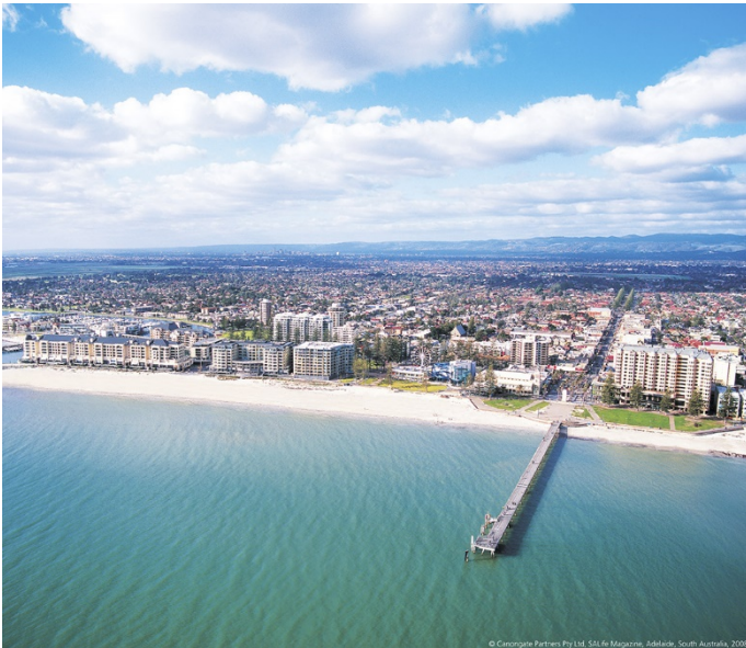
Glenelg, Adelaide, South Australia.

Slovenian Club is open every Sunday from 2pm - 8pm for socializing and dinner. You are all warmly welcomed.