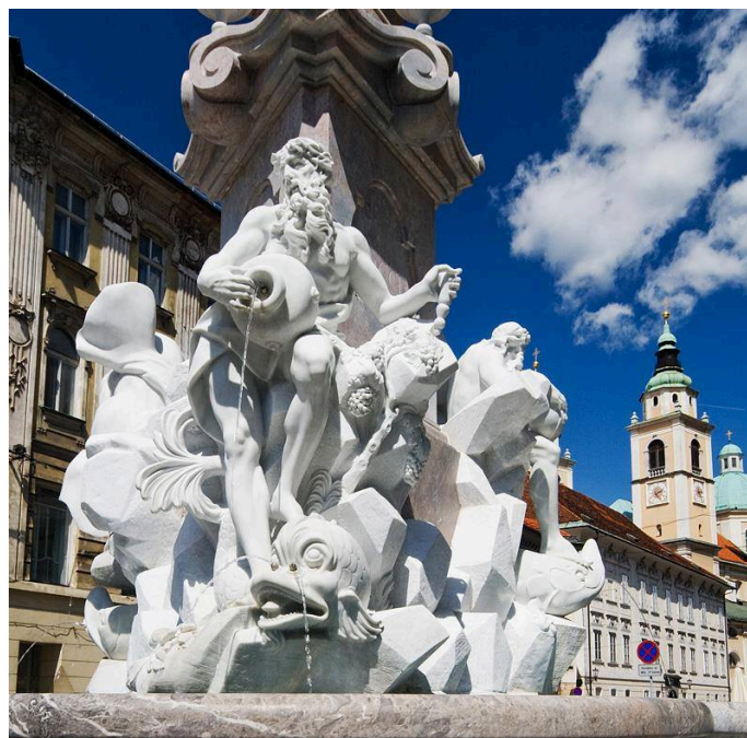
The Robba Fountain - Ljubljana