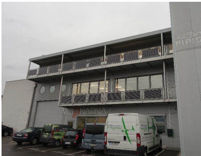
Pipistrel Goriška cesta 50a Ajdovščina Slovenia

The Australian Aerospace Alliance visit to Pipistrel in Slovenia was organized by the Slovenian Consulate in South Australia, and the Slovenian Embassy in Canberra, Australia.