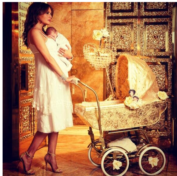
Melania in Barron

Zaradi svoje mladosti je Barron najmanj izpostavljen od Trumpovih otrok, nekaj podrobnosti iz njegovega življenja pa je med zadnjim desetletjem v različnih intervjujih razkrila njegova ponosna mama Melania.