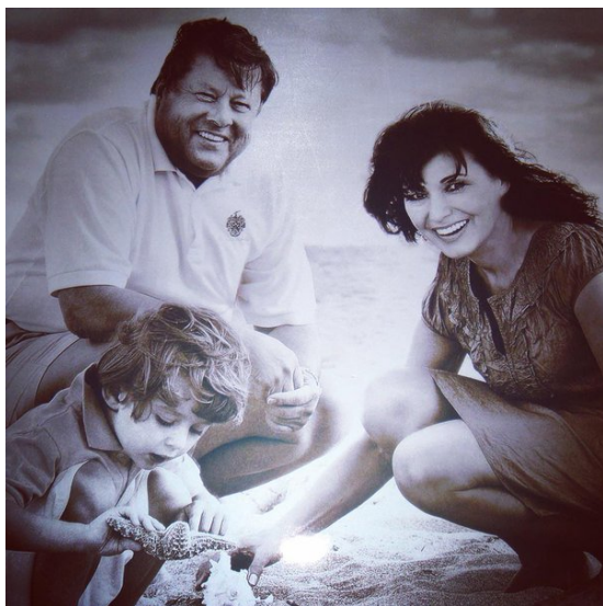
mati in oče Melania z Barron

Melania ga je nekoč opisala kot kombinacijo svojega in Donaldovega videza, po temperamentu pa naj bi bil podoben svojemu očetu, zato mu pogosto reče kar Mini Donald. Sina je opisala kot "zelo posebnega, pametnega fanta, ki ima svoje mnenje. Je neodvisen in natančno ve, kaj hoče". Novi prvi sin zelo rad igra golf s svojim očetom, najraje pa – tako kot oče – nosi obleke in kravato.