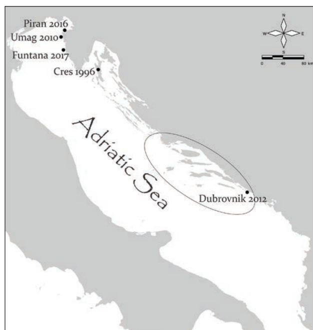
Fig. 1: Records of Calappa granulata in the Adriatic Sea: Piran 2016 and Funtana 2017 (the present work), Umag 2010 (Dulčić & Tutman, 2012), Cres 1996 and Dubrovnik 2012 are referred to specimens deposited in the Natural History Museum of Rijeka; the circle shows the geographic area indicated by Stossich (1880) and Štević (1990).

The shamefaced crab Calappa granulata (Linnaeus, 1758) is a sublittoral species known from the Mediterranean Sea and adjacent Atlantic Ocean from Portugal to Mauritania, including the Azores, Madeira, the Canary Islands and the Cape Verde Islands (Manning & Holthuis, 1981; Štević, 1990). More recent records in the Mediterranean Sea are the Gulf of Taranto (Ionian Sea) (Pastore, 1995), the Strait of Sicily (Spanò et al. , 2004), the coastal waters of the Sea of Marmara (Artüz, 2006) and Edremit Bay (Aegean Sea) (Balkis & Kurun, 2008). In the Adriatic Sea, Stossich (1880) mentioned this species as rare in Split, Hvar, Vis and Korčula. After 110 years Štević (1990) confirmed the rarity of this crab in the Middle and South Adriatic where it was recorded in waters off Šibenik, Split, Dubrovnik, Sestrunje, Hvar, Korčula and Vis. The last records from the southern Adriatic arises to Ungaro et al. (2005) who found some