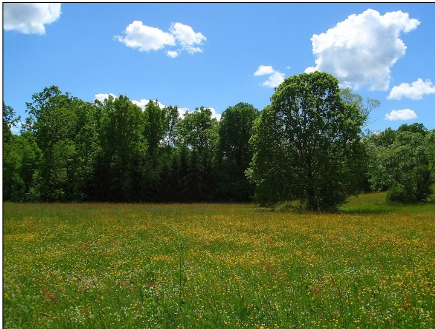
Figure 2. Dry meadow on the northern side of the study area, on which most butterfly species were recorded.

Slika 1. Položaj raziskovanega območja v kraju Donji Emovci, blizu Požege, Hrvaška.