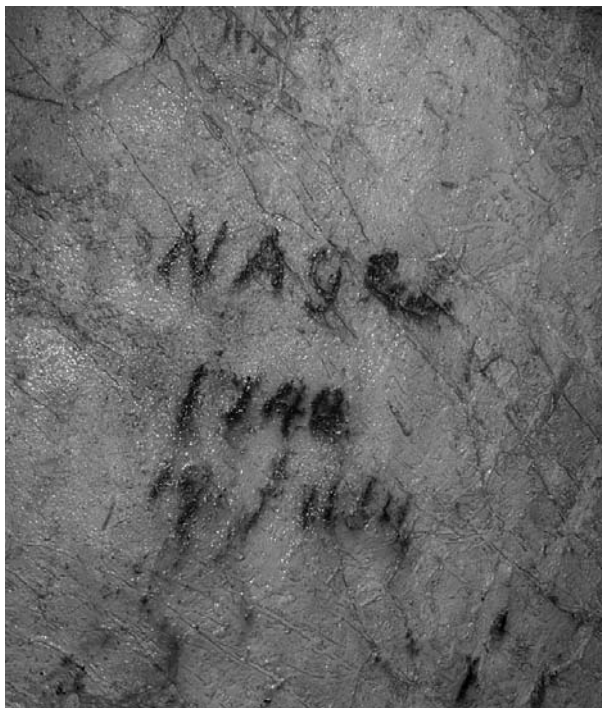
Fig. 3: Photograph of Nagel's inscription in Postojnska Jama.

Nagel also left his name in Postojnska jama. Habe already mentioned this (1986, p.14) but fails to give its position. On July 21 st , we visited the old gallery in Postojnska jama in search of Fercher survey team inscriptions (1833; see Kempe, 2005). We found Nagel's signature on the 45° sloping ceiling ca. 50 m from the access ladder (Fig. 2). It occurs – with a few other signatures (termed Old-Cave Panel 1) – at a place where there is no substantial speleothem growth. The signature is small and consists only of three lines (Fig. 3):