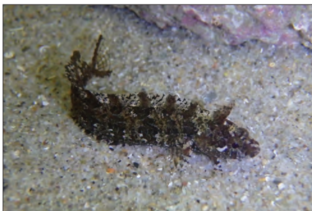
Fig. 1: A specimen of Clinitrachus argentatus found in Slovenian coastal waters.

The data regarding the occurrence of C. argentatus in the Adriatic Sea are scarce, limited and sporadic. Patzner (1985) reported the finding of two specimens