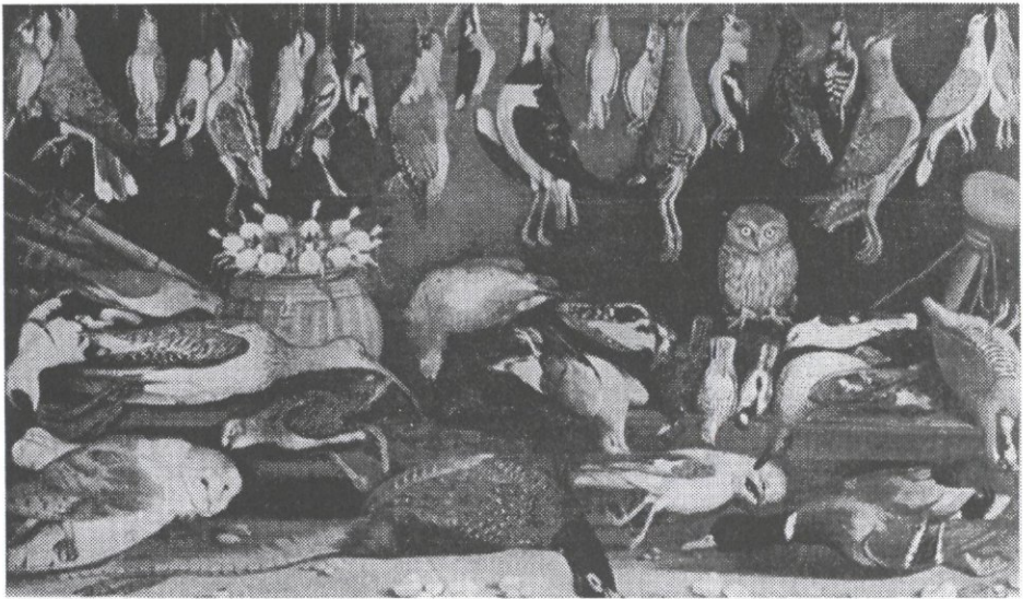
6. “Still Life with Birds” (Caravaggio?)

If there is nothing at the deep-structure level that holds the series of “made things” together from beginning to end, it will be little surprise to find that the arts of the baroque flaunt discontinuity and disarray as a condition of culture itself. 29 “Culture” is imagined as a kind of collection, usually of disparate things, and sometimes with maximum disregard for the organizing force of their original social or geographical contexts. Hence the interest in “composite” architectural scenes featuring buildings – usually in the form of ruins – whose relationship to one another may be independent of their location in time and/or place. Hence also the great interest in the adjacency of the different arts and in the production of “synaesthetic” forms. Already in Las