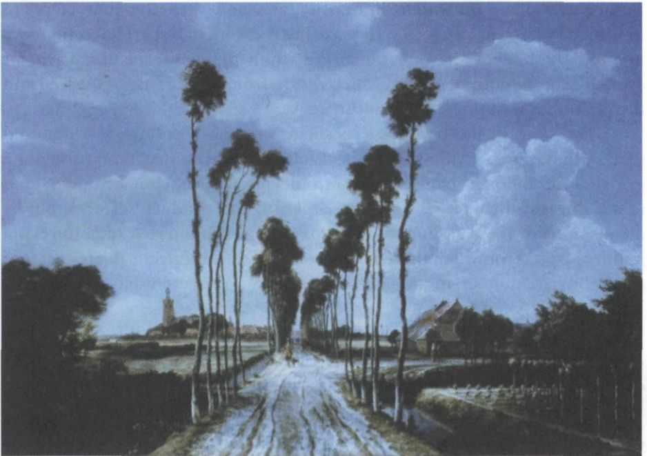
8. Hobbema, "Middleharnis Avenue"

to the surface and energize it. There is a grammar and a mode of agency that can be associated with these effects, but it is not one that we are accustomed to recognize from the models of causality that work in the physical world. Consider the example of façades that curve (St. Philip Neri Oratory, San Carlo alle Quattro Fontane), of columns that twist (Bernini), or of trees that bend in response to no identifiable force in nature ( fig. 8 ). Insofar as these torsions are effects standing in need of causal explanation at all, we might do best to describe them as self-caused. They are phenomena of the sort that we might associate with a psychology of subjective consciousness, were it possible to ascribe subjectivity to such things. Building on Leibnitz' notion of the "predicate in the subject," one can locate the rough equivalent of this logic within the field of "characterology," which takes a special interest in passions that overwhelm whatever causal account of them we might be able to provide. (Rosalind Krauss's observations on Rodin's Adam move in a similar direction: "What outward cause produces this torment of bearing in the Adam ? What internal armature can one imagine, as one looks on from the outside, to explain the possibilities of their distention? Again one feels backed against a wall of unintelligibility. For it is not as though there is a different viewpoint one could seek from which to find those answers. Except one; and that is not