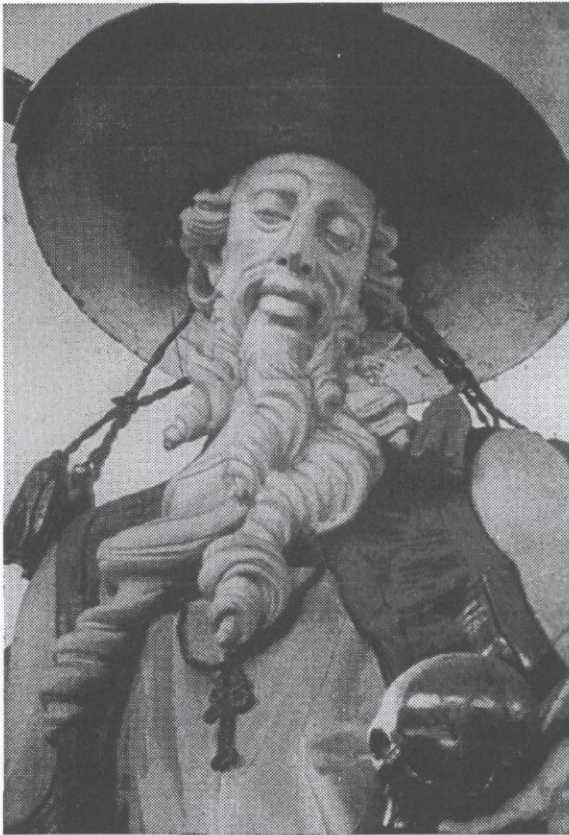
7. Pilgrimage Church, Wies (Bavaria), statue

The Leibnitz-Deleuze notion of the fold replaces that of the Platonic weave. Moreover, it concentrates in ways that deep structure theory does not on the texture of the material in question. Remember that while the Leibnitzian monad is a “simple substance” there is within it a mani-foldedness that allows it to take on distinctive attributes and to change: “There must be differentiation within that which changes ... [this] must involve a plurality within the unity of the simple ... And consequently the simple must contain a large number of affections and relations, although it has no parts” ( Monadology , secs. 12, 13, in Philosophical Writings , p. 180). One of the great attractions of this notion for an aesthetic theory of culture is that it allows us to account for