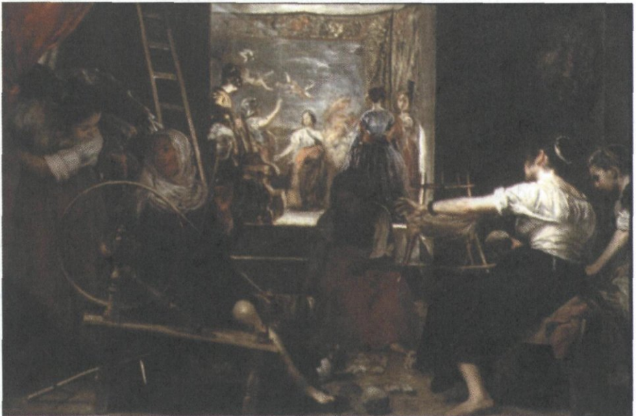
1. Velásquez, “ Las Hilanderas ”

I begin with an image, exceptionally famous and, by overwhelming consensus, baroque: Las Hilanderas by Velásquez (fig. 1). In the foreground is a homely workshop scene, with five women shown working around a spinning wheel, fashioning the threads that will go to make a decorative tapestry. In the background hangs the very kind of tapestry that is the result of this work: the stuff of nature, transformed into a thing of beauty by tools and human skill. But there is a curious doubling between the two scenes. The “background” tapestry illustrates a scene from the myth of Arachne, a mortal who became so skillful at weaving that she ventured to challenge the goddess Athena to a