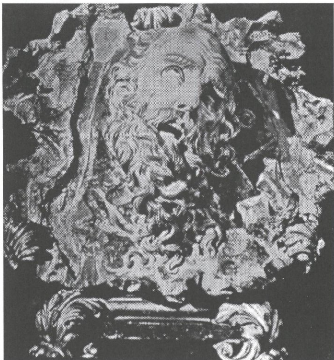
9. Villabrilie, “Head of St. Paul”

exactly a place from which to look at the work – any of Rodin’s work – but, rather, a condition. This condition might be called a belief in the manifest intelligibility of surfaces , and that entails relinquishing certain notions of cause as it relates to meaning, or accepting the possibility of meaning without the proof or verification of cause. It would mean accepting effects themselves as self-explanatory – as significant even in the absence of what one might think of as the logical background from which they emerge.” 38 ) In such cases the result is a surface that can’t be characterized as either active or passive, shallow or deep. It is at once a “pure effect” and the result of indeterminate causes. Even where the aesthetic surface is organized as a grid, there is what Deleuze describes as a “surface tension” at work in it, 39 which is to say that one must reckon with effects that follow from its organization as a surface that appeals to sense. The culture of the baroque excels in the cultivation of just this kind of surface tension, producing energies that can’t be reduced to any underlying cause. And so it is with “culture” itself, which is neither a formative process