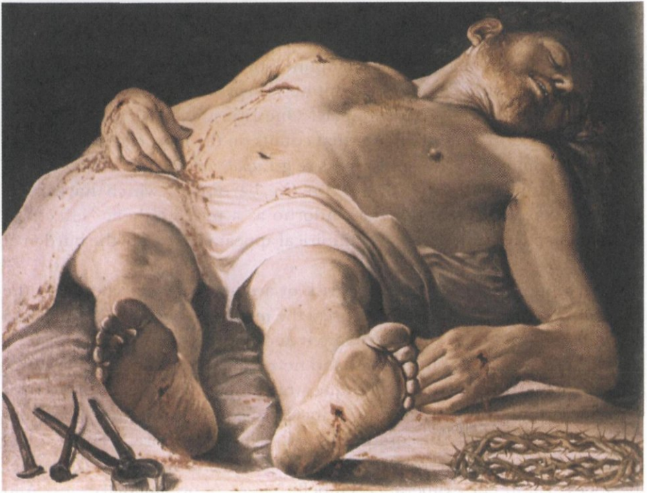
5. Caracci, "Dead Christ"

the creation of an organized surface wherein perspective is a prior condition for the appearance of any truth. Perspective implies the necessity of seeing things from a finite place, but here "place" implies both the definiteness of physical location and something like the focus of conscious attention. Panofsky gets close to this idea when he argues that spatial tensions in baroque art produce a "subjective intensification," 22 but I think he misses the point that such intensification registers the fact that subjectivity is a condition for viewing surfaces that in turn creates an intensity in the surfaces.