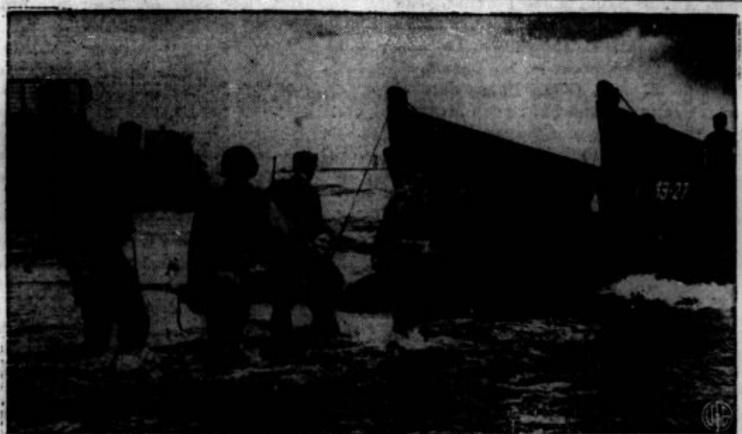
Oddelek ameriške mornarice, katerega naloga je bila, da je prepeljal na zavzeti otoč Leye vojaštvo in vse potrebščine, odpeljava nazaj grede ranjenec. Na sliki je videti vojake, ki na nosilnicah prenašajo ranjene tovariše nazaj na ladje.