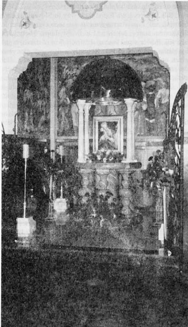
The new Marija Pomagaj Chapel

A packed gathering of 800 to 900 persons came to St. Vitus Church in Cleveland, Ohio on the feastday of Marija Pomagaj, May 24, 1994 and experienced a once-in-a-lifetime event, the blessing and transferring of the Marija Pomagaj icon into the newly completed chapel of "Our Lady, Help of Christians". It was a warm spring evening, filled with praying and singing to Our Lady.