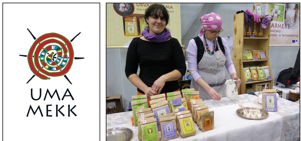
Figure 2: Logo of the regional brand Uma Mekk (left) and Micro-producers selling their Uma Mekk products at the Annual Uma Mekk Food Fair in November 2017 (right).

The name Uma Mekk comes from the regional dialect, highlighting the connection with this cultural-historical region. The logo of the brand that is used both on sticker labels on products and in catering establishments has a visually distinguishable design created by a local artist. The aim of the brand has been to create better market opportunities for local micro-producers by organising Uma Mekk Food Fair in November each year and supporting entrepreneurs' participation at other food fairs and events in Estonia,