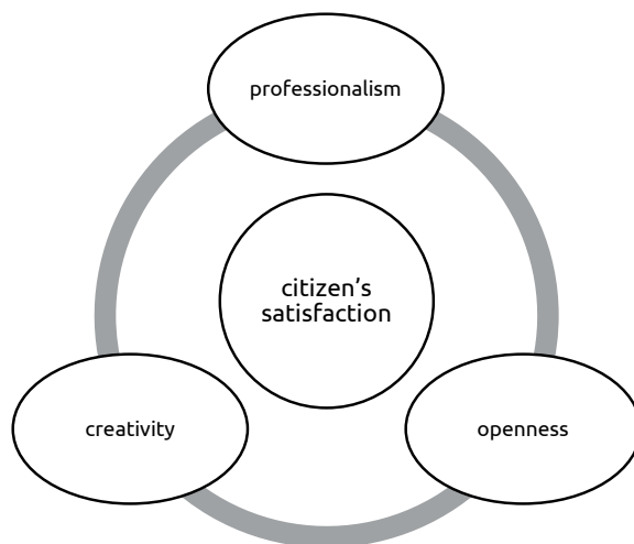
Figure 2: Main factors influencing the citizen's satisfaction

to be creative by means of participation and allowing government to create favourable environment for sharing knowledge and cooperation in various disciplines. Combination of governance's professionalism (including skills and knowledge), governance's openness (in sense of transparency and equality of opportunities) and creativity (use of new forms to solve old problems) are the main pillars of the proper functioning of the public sector at present and also the main factors that affect citizen's satisfaction through smart, innovative and creative manners (Figure 2).