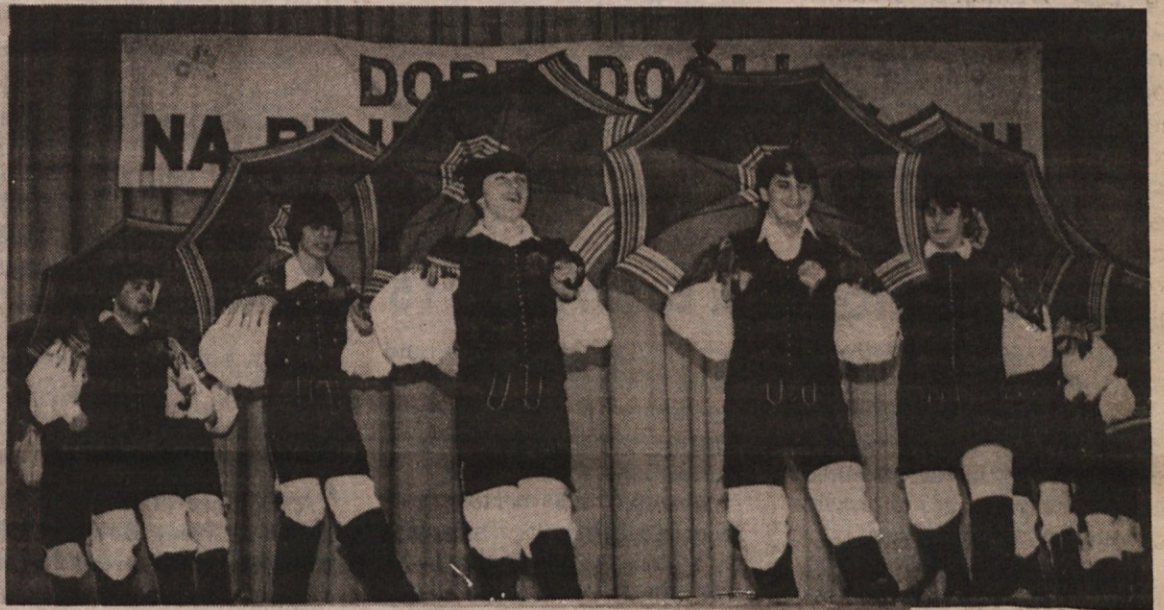
Members of the Slovene Folklore Institute of America perform the Umbrella Dance at the Dinner-Show-Dance of the Primorski Club