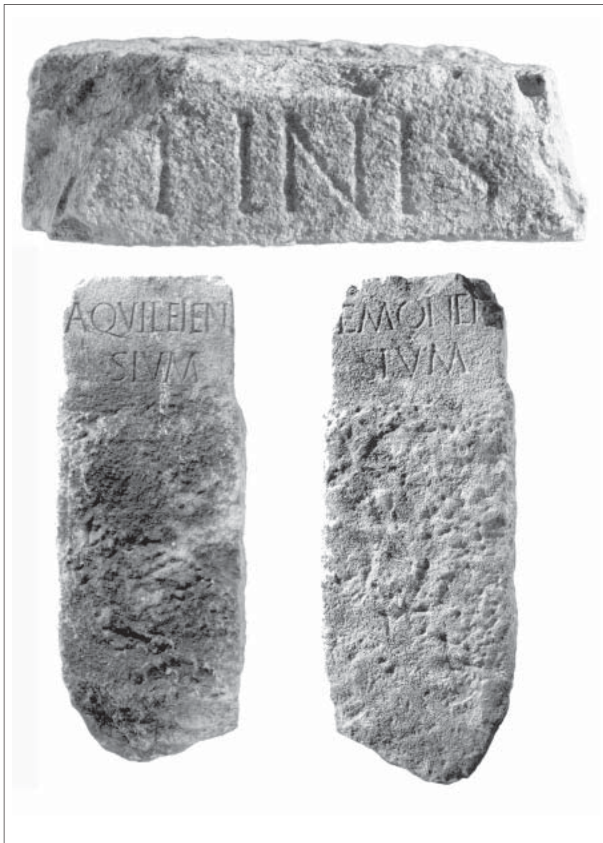
Fig. 2: The inscriptions on the boundary stone from Bevke. Sl. 2: Napisi na mejniku iz Bevke.