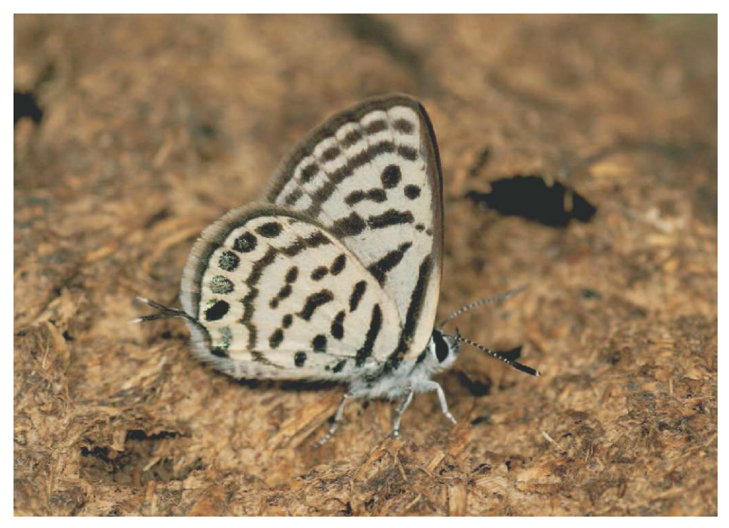
Figure 3. Tarucus balkanicus was found at several new sites in Macedonia. Slika 3. Tarucus balkanicus je bil najden na nekaj novih lokalitetah v Makedoniji.

Macedonia and those from Konecka Mts. are new for this species and well extend its distribution towards NE in Macedonia. The butterflies were observed in dry rocky places; in Radanje mud pudelling was seen.