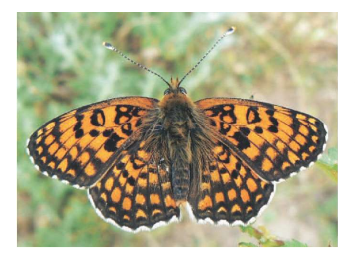
Figure 2. Melitaea telona, a new species of the fauna of the Republic of Macedonia.