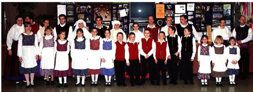
An event and facility presented for the members and supporters of St. Gregory the Great Slovenian Church and Roman Catholic Diocese of Hamilton