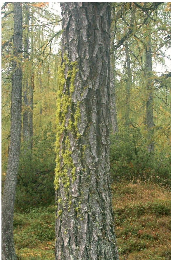
Figure 4: Subalpine larch stand above the pasture Klek, typical locality of Letharia vulpina

9649/3 (UTM 33TVM13): Slovenia, Gorenjska (Upper Carniola), the Julian Alps, the slopes of Jezerski Stog above the alp Planina pod Mišelj