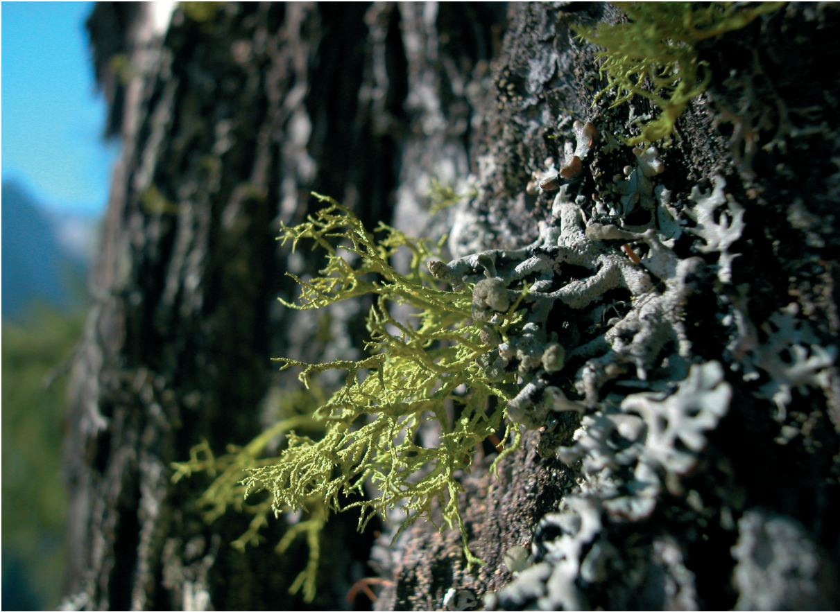
Figure 3: Letharia vulpina , Brinova glava, the Julian Alps Slika 3: Letharia vulpina , Brinova glava, Julijske Alpe

9548/3 (UTM 33TVM04): Slovenia, Gorenjska (Upper Carniola), the Julian Alps, Sleme, slopes under Slemenova špica, above the Mala Pišnica valley, near the Sleme–Grlo mountain path, open larch forest, from about 1570 to 1760 m a.s.l., on some 20 old larch trees with breast height diameters of 50 to 100 cm. Leg. & det. I. Dakskobler & A. Seliškar, 1. 9. 2010, Herbarium ZRC SAZU (SRC SASA).