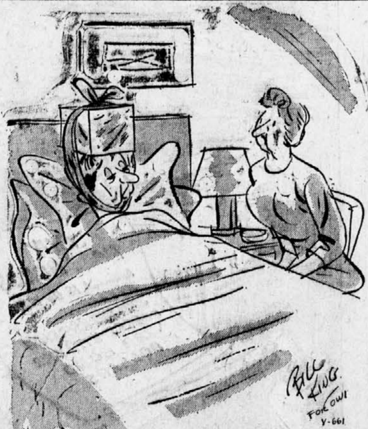
THIS REMINDS ME, DEAR—ORDER SOME COAL NOW FOR NEXT WINTER.

Remember... HE is depending on YOU!—Buy More War Bonds!