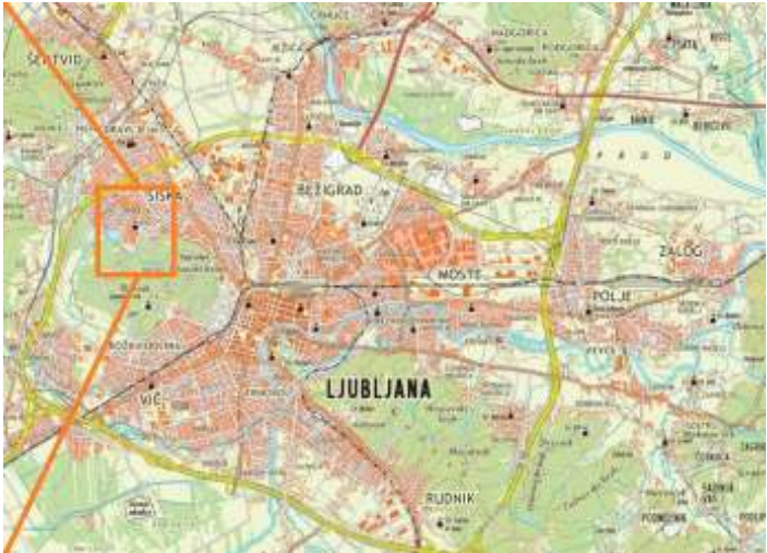
The tennis balloons are located near Ilirija's speedway track and the latter lies in the Northern part of Ljubljana.