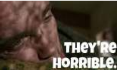
Arnold in Kindergarten Cop.