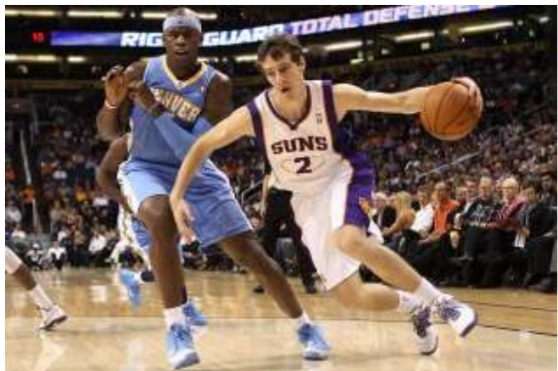
Brothers Zoran Dragić (left picture) and Goran Dragić both played for Suns at one point of their careers.