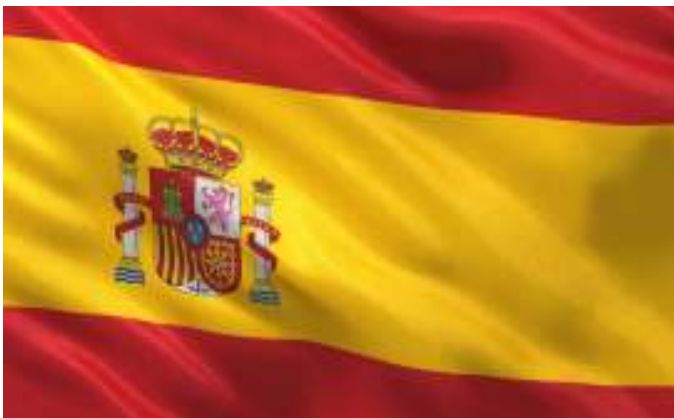
Flag of Spain, a country where Luka learned to speak Spanish.