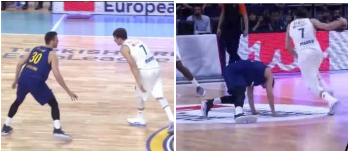
Luka Dončić's double ankle breaker crossover during the game against Barcelona in the 2017/2018 season.