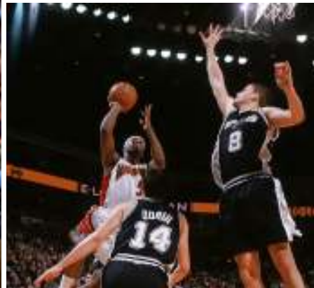
Milić playing for the Suns (left picture) and Beno Udrih and Radoslav Nesterović for Spurs (right picture)