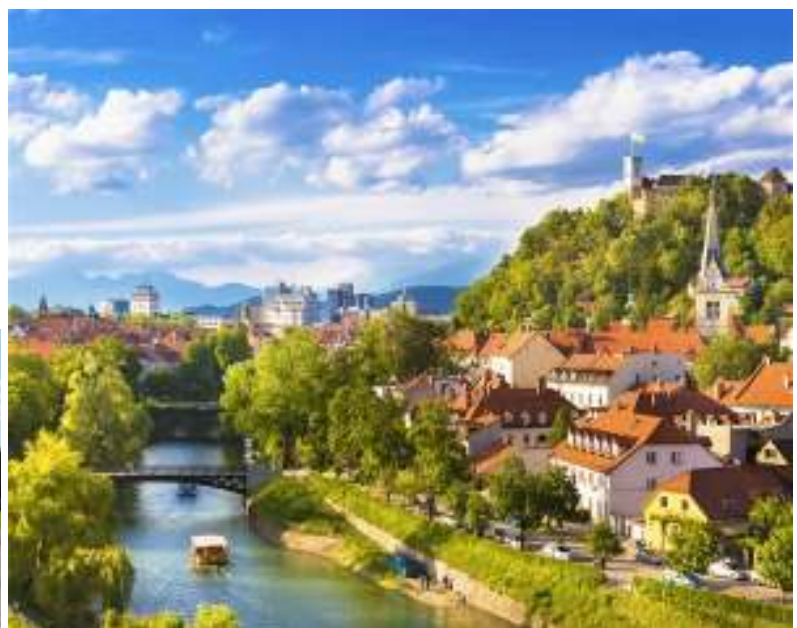
The beautiful 'beaches' (left picture) of the river Ljubljanica (right picture) where you can 'bake' in the sun.