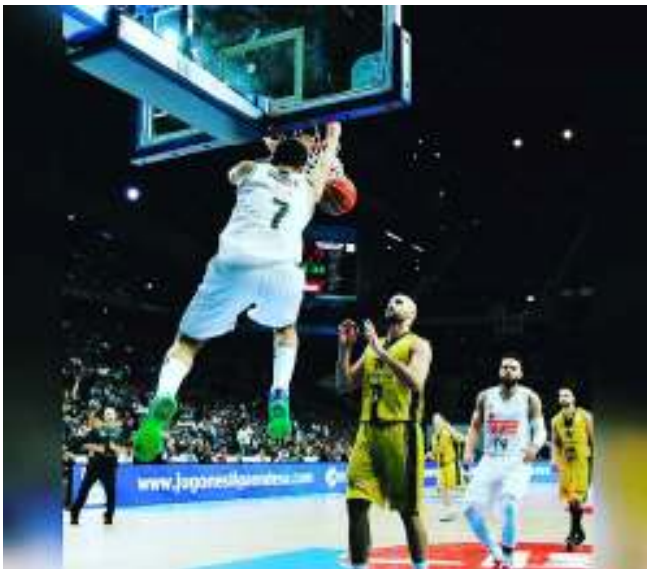
Dunking during an important game against Tenerife.