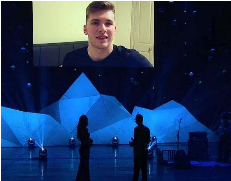
Mother Mirjam Poterbin and the host are watching Luka Doncic on big screen at the ceremony in Ljubljana.