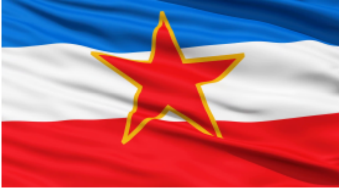
Flag of former Yugoslavia. Its breakup in 1991 formed 7 new countries, including Slovenia.