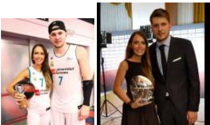
Proud mom always there by her son's side.