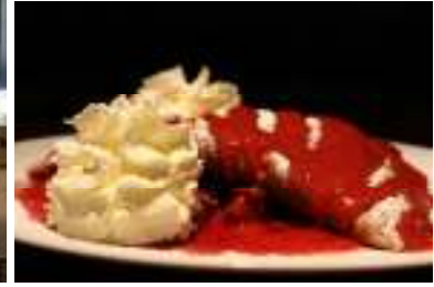
Emblem of Ljubljana (left picture), restaurant Julia (middle picture) and pancakes from Romeo (right picture).