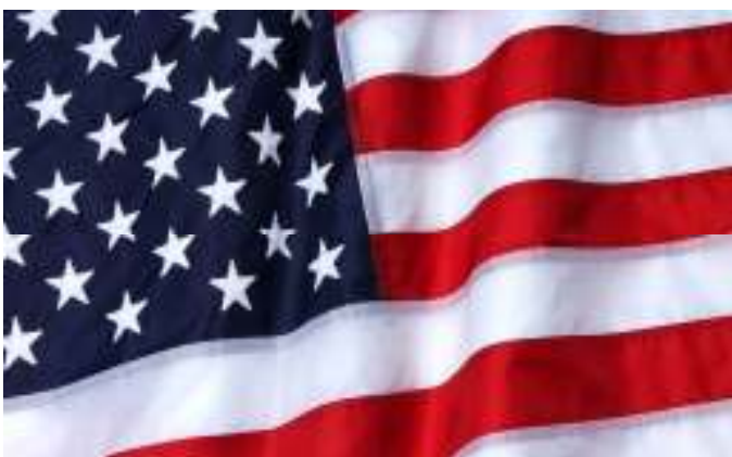
Flag of USA. English became the fourth language Luka was able to speak, the third being 'former Yugoslavian'.