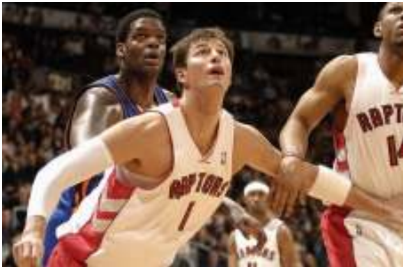
Primož Brezec at the time playing for Toronto.