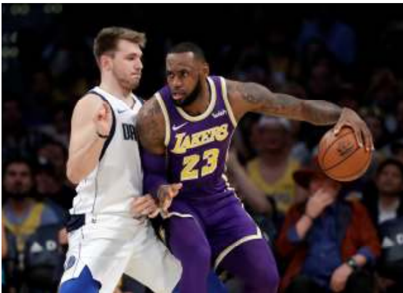
Luka was able to make back to back blockades against the big man LeBron James during the game in LA.