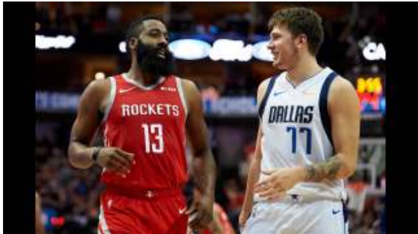
Logo of Luka's Dallas Mavericks (left) and the start of playing against the biggest superstars (James Harden).