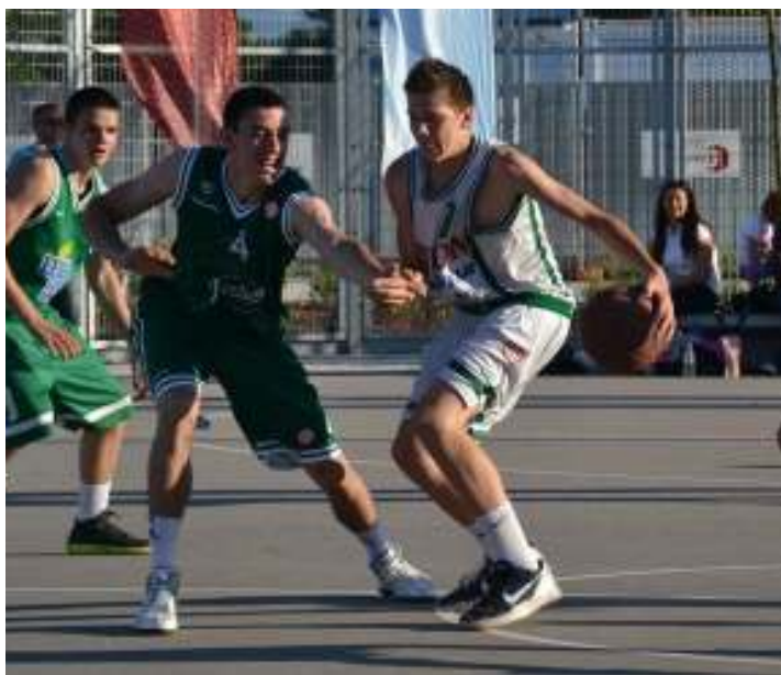
According to the Spanish Wikipedia Luka Dončić officially became a member of the club Olimpija in 2010.