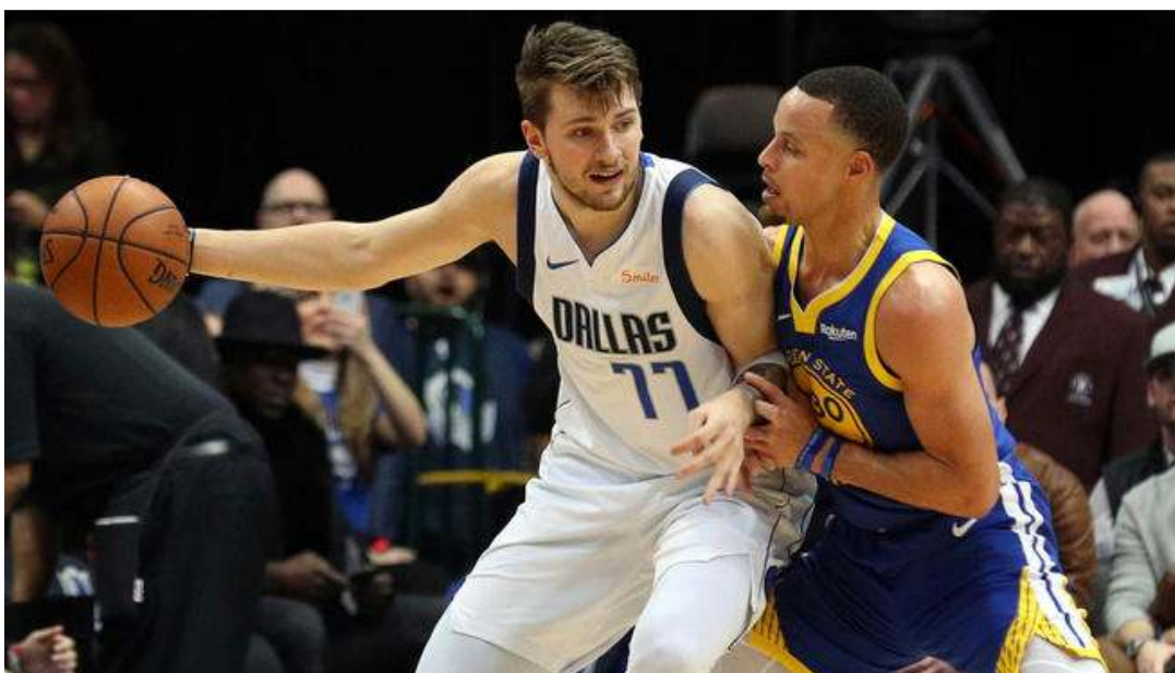
The Alfa and Omega Stephen Curry and the rising star Luka Dončić alias Donke Jr.