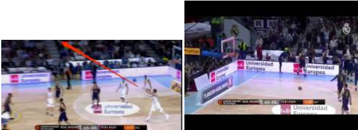
The full court shot of Luka Dončić in the same game as he had done his double ankle breaker crossover.