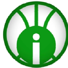
Logo of team Ilirija.