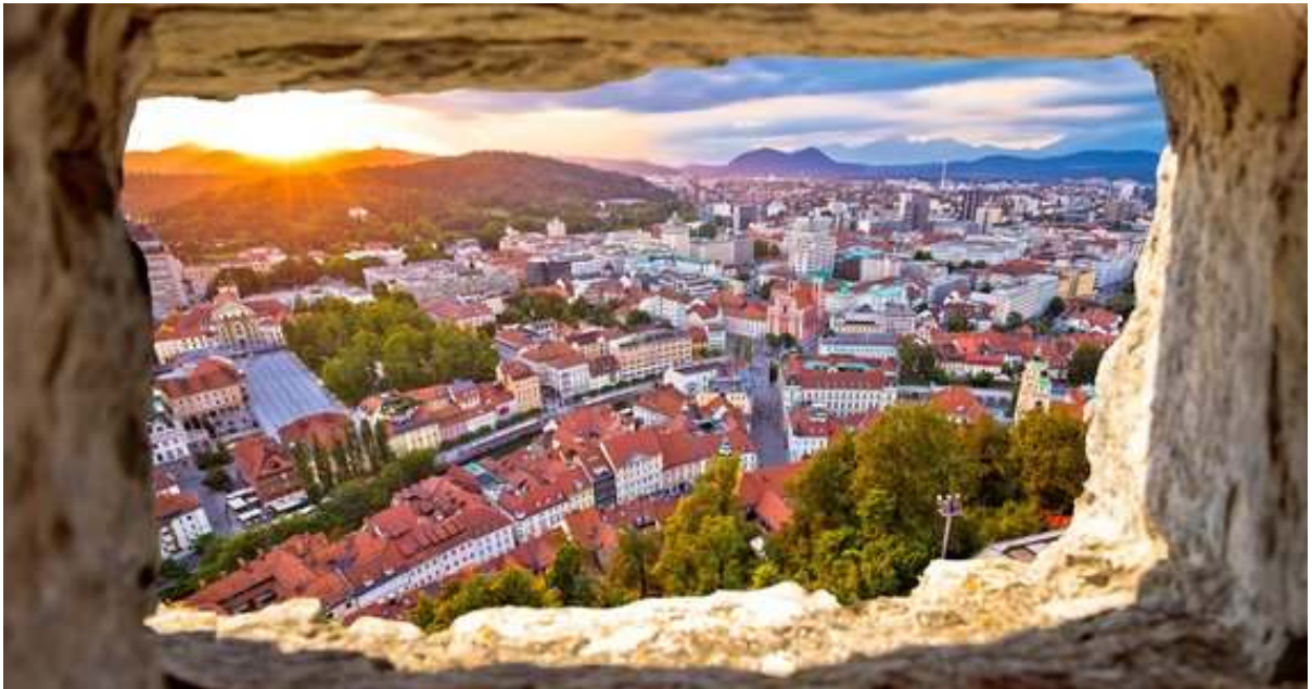
Ljubljanski grad or The Castle of Ljubljana has a magnificent view and is a must when you come to Ljubljana.