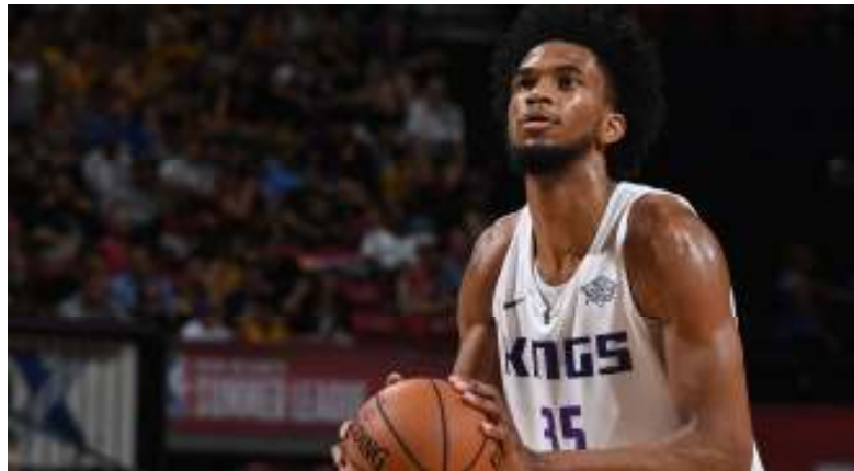
Deandre Ayton from Bahamas (left picture) and Marvin Bagley III from USA got picked as first and second.