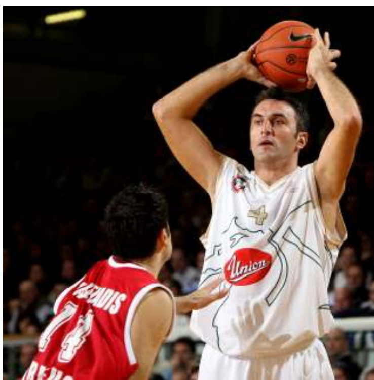
First and only titles for Sasha came in seasons 2006/2007 and 2007/2008 with clubs Helios and Union Olimpija.