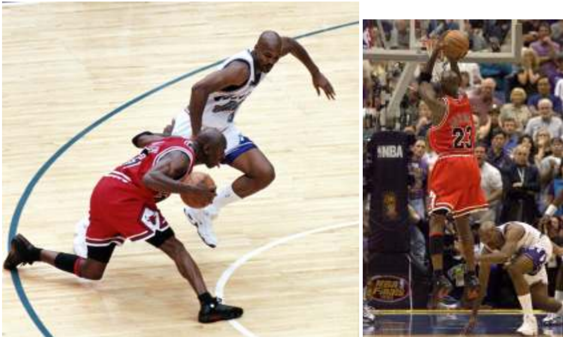
Michael Jordan's famous 1998 move against Bryon Russell looks a lot like Luka's crossover.