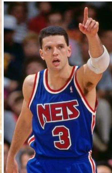
Petrovic and Jordan playing for their national teams (left picture) and Drazen in NBA (right picture).