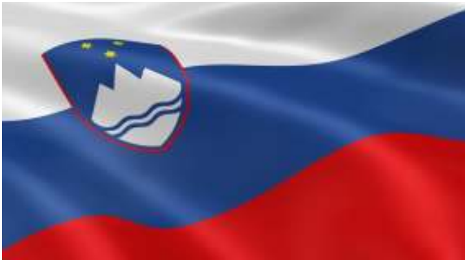
Flag of Slovenia, birthplace of Luka Doncic.