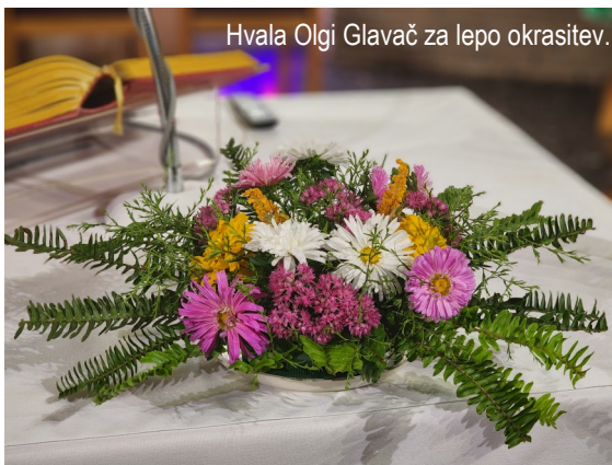
Hvala Olgi Glavač za lepo okrasitev.

Outside of these regular office hours please call 1-888-728-1742 to reach our Browns line staff; if you get the voicemail please leave a message and someone will call you back. You can also reach us via email or online at www.moyafinancial.ca .