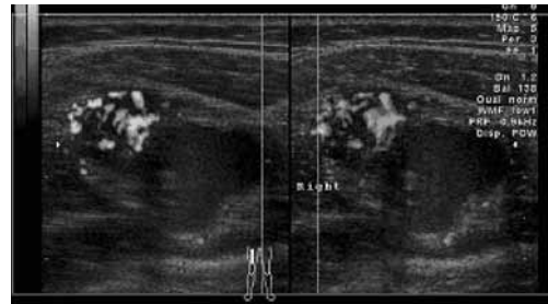
Figure 2. Hypervascularized area with sonographic characteristics of vascular malformation (hemangioma) positioned closely to the hematoma ventrolaterally in the proximal third of the thigh (horizontal orientation).

Hypervascularized area with sonographic characteristics of vascular malformation (haemangioma) was depicted near the haematoma, ventrolaterally in the proximal third of the thigh (Figure 2). Recidivous