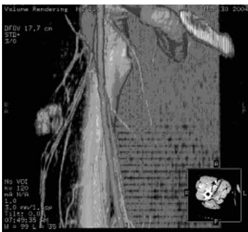
Figure 3a. Volume-rendering VR reformation – right femoral region-coronal plane (vertical orientation).

The repeated Doppler US, performed 10 and 11 months after trauma, showed a higher flow with high peak systolic values only in the deep femoral vein and the reduction of the right femoral hypervascularized structure size. The spiral CT scan, performed 11 months after trauma, depicted a hypervascularized lesion supplied from the deep femoral artery muscular branches positioned ventrolaterally in the right thigh proximal third. The hypervascularized lesion was equally good opacified with contrast material in the arterial and venous phase, with one avascular zone ventromedially (Figures 3, 4). The patient still had swollen right leg but there was no palpable mass in the area of vascular malformation described in the CT report with thrill and bruit over them.