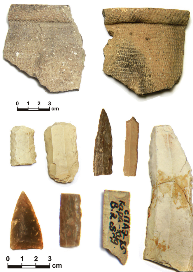
Fig. 3. Pottery and flint tools of the Khvalynsk culture.

tributed throughout the whole of the steppe zone. The lithic industry of this culture differs from the flint industry of preceding cultures, as it includes heavy flakes produced by enhanced pressure knapping. Scrapers, knives, points on large blades, and triangular arrowheads with a truncated base predominated. There are also insets on narrow blades. Pottery was made from clay tempered with crushed freshwater mollusk shells. The upper part of the round-bottom vessels is thickened (Fig. 3). The deco-