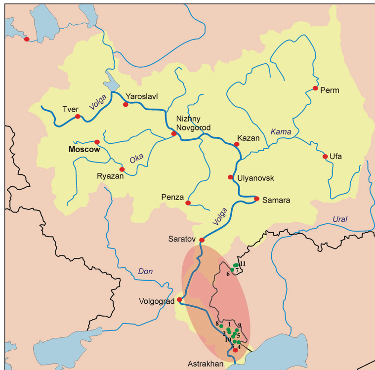
Fig. 1. Map of the Lower Volga region. 1 Kugat IV; 2 Kulagaysi; 3 Kairshak III; 4 Baibek; 5 Tenteksor; 6 Varfolomeevskaya; 7 Algay; 8 Karahuduk; 9 Kombakte; 10 Kurpezhe molla; 11 Oroshaemoe.

The climatic factors which influenced the transition from one period to another present a complicated picture (Budja 2007). Extensive aridisation is thought to have occurred between 6400 and 6300 BC in the southern part of the Low Volga basin (Bolikhovskaja 1990). This is also verified, according to the ^{14}\text{C} dates, by the absence of inhabited settlements at this time. Thus, the beginning of Neolithisation and pottery making in the Lower Volga basin could not have been connected to natural factors. The situation changed after the aridisation ended (6200 BC), and the number of sites increased (Kairshak I–IV, Baibek). Settlements became long-term; living conditions and the economic system changed, and so a great number of household objects, dwellings, artefacts and faunal and fish remains from that time can be found (Grechkina et al. 2014). We can suppose that the initial inhabitants of Kairshak-type sites in