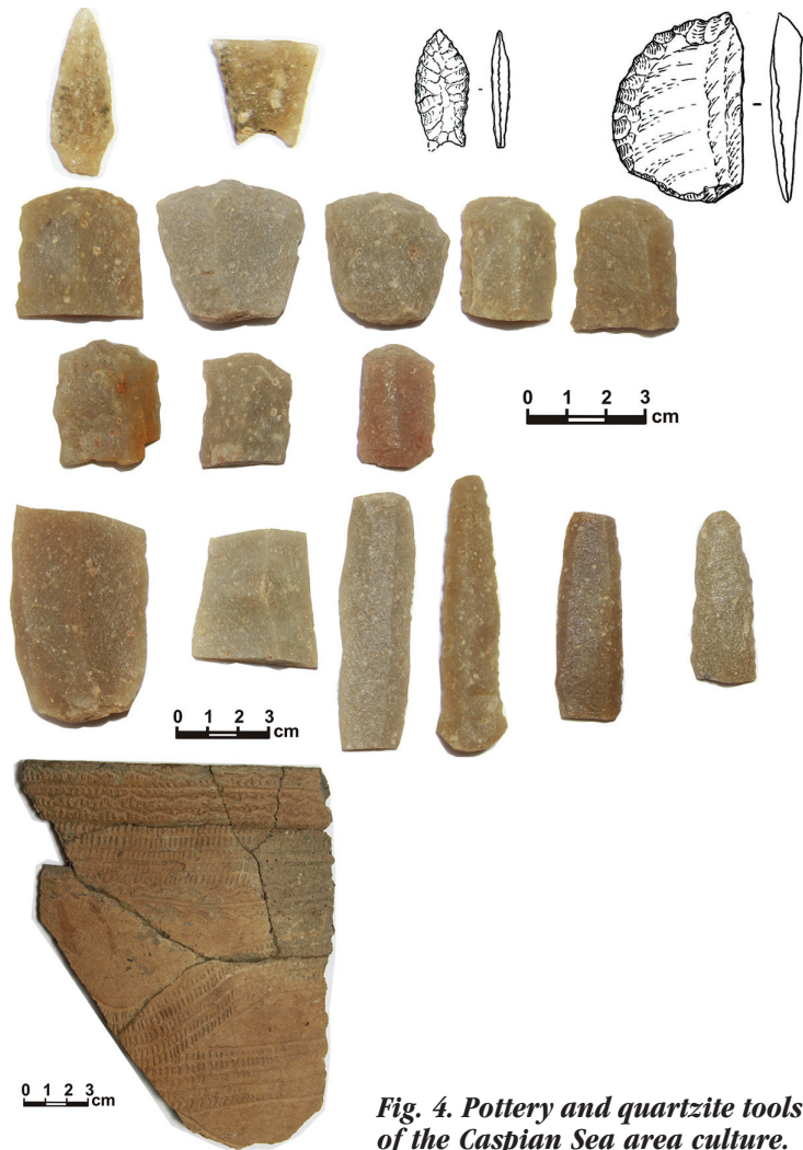
Fig. 4. Pottery and quartzite tools of the Caspian Sea area culture.

Evidence of a quartzite stone industry has been found at Prikaspiiskaya sites (Kurpezhe-molla and Oroshae-