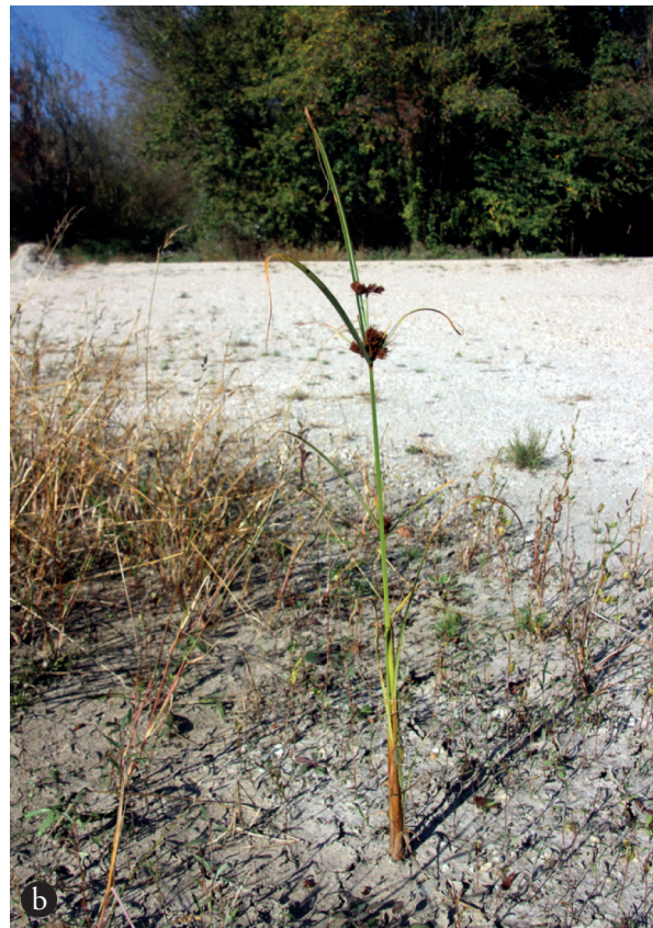
Figure 2: Vegetation of desiccating pools with Cyperus glomeratus L. in Štúrovo (a) and Čenkov (b) in SW Slovakia on the left bank of the Danube Slika 2: Vegetacija izsušenih uleknin z vrsto Cyperus glomeratus L. na nahajališčih Štúrovo (a) in Čenkov (b) na jugozahodnem Slovaškem na levem bregu Donave.

On the opposite side of the Danube in Hungary, where are analogous ecological circumstances, C. glomeratus is relatively common in the favourable years (Barina & Schmidt 2004, Schmidt 2014). We present the following relevé from Győr from a nonstandard area of 2 × 2 m for the purpose of comparison the vegetation with the newly discovered locations in Slovakia.