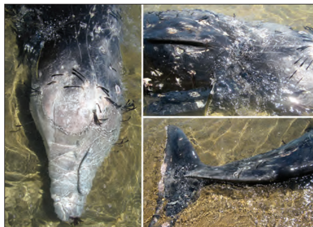
Fig. 2: Body parts of the Cuvier's beaked whale stranded in Santa Barbara Beach, Corfu Island, Greece, on 12 July 2016. More than 35 specimens of the parasitic copepod Pennella balaenoptera are visible in the photograph of the head area.

Today, the barnacle genus Conchoderma is represented by three living species according to Chan et al. , (2009). Conchoderma virgatum Spengler, 1789 and C. auritum are present in the Mediterranean Sea (Koukouras & Matsa, 1998). The rabbit-ear barnacle C. auritum had only been reported from the western Mediterranean basin (Koukouras & Matsa, 1998) before our observation, and it is somewhat surprising that no other reports were available for the eastern Mediterranean basin, since the species has a cosmopolitan distribution (Chan et al. , 2009). Throughout the cetacean fauna of the Mediterranean Sea, it was reported to have been found on a Cuvier's beaked whale stranded in Algiers (Monod, 1938 in Clarke, 1966) and on the left mandible of a striped dolphin Stenella coeruleoalba (Meyen, 1833) that stranded in Sicily (Sampieri) in 1991 (Insacco et al. ,