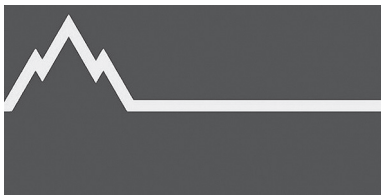
Figure 7: Selected suggestion for a new state flag by the magazine Mladina , 2002

National symbols need to be carefully selected in order to be as all-embracing and homogenizing as possible if they are to bring together a collectivity as diverse as a nation. The new Slovenian authorities were in a rush when the independent state required the swift adoption of new public symbols in 1991. In subsequent years, state officials therefore continued to change some of the state’s most prominent public representations. In fact, the process – although much more consolidated after twenty-six years of statehood – is not complete. Moreover, even though the public has gradually internalized and accepted the existing state symbols after twenty-six years, most prominently in the form of Billig’s waved flags at various sporting events, state-building processes can never be seen as fully complete. Ongoing discussions surrounding the proposals for changing the state flag of Australia or a recent referendum on a new flag in New Zealand testify to this.