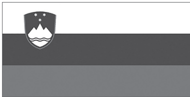
Figure 4: The flag of the Republic of Slovenia since 1991

The change in the state anthem was clearly evident; Yugoslavia's hymn to the Slavs was replaced by a nineteenth-century poem written by the Slovenian "national poet" France Prešeren. Prešeren's Zdravljica (A Toast) as a symbol of Slovenian national identity replaced the old state hymn Hej Slovani (Hey Slavs), which praised the Slavic spirit of brotherhood and unity. Prešeren wrote his poem in the nineteenth century, when what is now Slovenia was part of the Austrian empire. In 1844 the Austrian authorities banned it due to its call for the unification of the Slovenians, which contradicted the principles of the monarchy. Prešeren can be seen as a "myth-making" intellectual, who combined a "romantic search for meaning" with promotion of the national idea (Hutchinson 1994: 44–45). He is seen as the "father" of the nation because he chose to write in Slovenian rather than German and because he put the Slovenian language and culture on a pedestal, thus making his literary opus a notable part of Slovenian national identity.