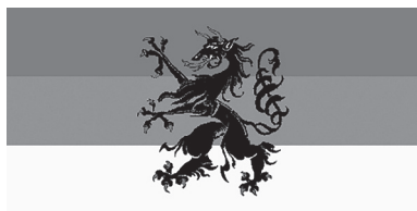
Figure 5: One of many suggestions for a new flag, depicting the black panther of Carantania

The greatest bone of public contention seems to have been the issue of Slovenia having too low a profile as a distinct state. There have been problems with its name, which many find difficult to differentiate from Slovakia or Slavonia. Further, the flag appears to be very similar to several other Slavic countries’ flags; for example, Slovakia or Russia. A prominent Slovenian ethnologist and art historian, however, asserts that the white-blue-red tricolour (without the coat of arms; see Figure 1) is a real and authentic Slovenian symbol and supports his argument with explanations of different origins for the similar Russian, Slovak, Croatian, and Serbian flags (Ovsec 1993). He does not support claims for the “historical” symbols (see Figure 5) to replace the current flag. His most important argument is that the Slovenian tricolour is actually older, and thus has a more valid claim for originality, than the Russian or Slovak flags.