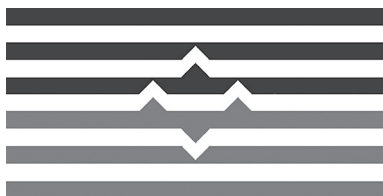
Figure 6: Officially awarded selection for a new state flag, 2003

Nevertheless, an initiative to change the state symbols was put forward in the Slovenian parliament in the spring of 2001, and there was a public announcement welcoming suggestions for a new flag in June 2003. The supporters of the change believed that the politicians were in too much of a hurry after independence and hastily accepted “politically constructed” state symbols (Bavčer 2001). In 2003 the evaluation committee published the results of a public anonymous competition for the design of possible elements for the