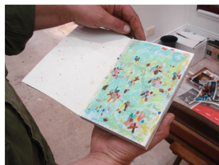
Daniel's sketch book

The time required to complete paintings varies, with major works taking up to two months to complete. Daniel exhibits his paintings in other parts of Australia and in New Zealand.