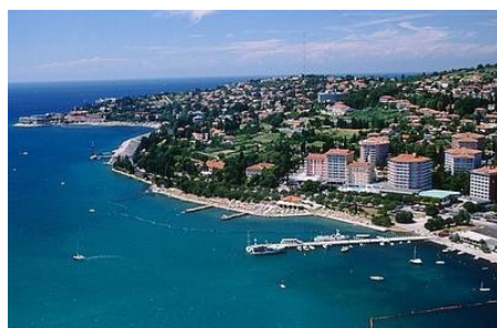
Panorama of Portoroz.