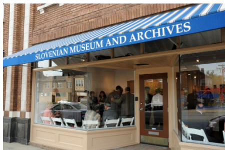
Slovenski muzej in arhiv / Slovenian Museum & Archives, Cleveland

Slovenski muzej in arhiv (SMA) je nepridobitna ustanova, katere namen je na različne načine in v mnogih oblikah ohranjati kulturno dediščino in s tem narodno zavest Slovencev v Ameriki in Clevelandu.