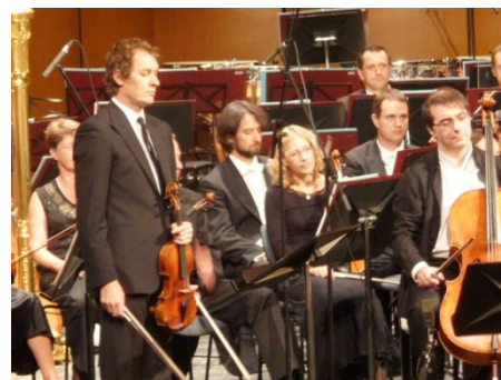
Richard Tognetti (standing) with the Slovenian Philharmonic Orchestra.

The highlight of the opening night of Festival Maribor was performed by about 85 members of the Slovenian Philharmonic Orchestra, impressively conducted by the Slovak conductor Juraj Valcuha and other participating guest artists. Among them was Australian violinist, conductor and composer and at the same time Festival Maribor's Artistic Director Richard Tognetti.