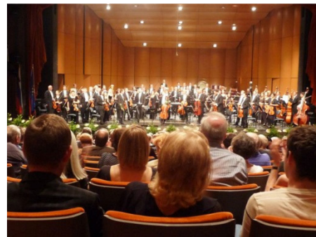
Maribor Opera house

The opening concert was an excellent performance enjoyed by the packed audience in the large hall of the Maribor Opera house. The impressive program with works from Anton von Webern, Johannes Brahms and Gustav Mahler (Symphony No.1 in D- Major - "TITAN") ... was just impressive, especially as not too often do we have an opportunity to listen to Mahler's masterpiece live.