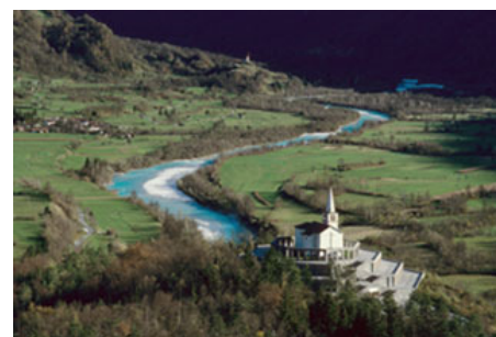
The Kobarid Walk of Peace is dedicated to the memory of the multitude of