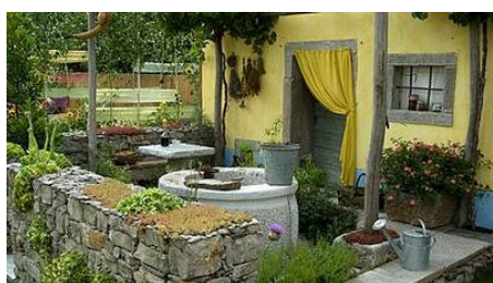
Pepa's Karst Garden.