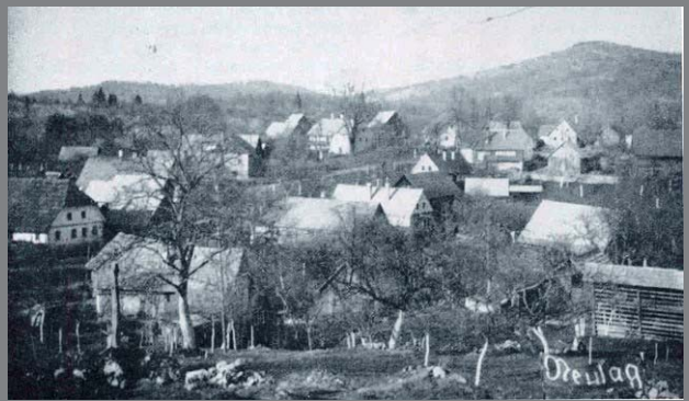
The village of Neulag, Gottschee, circa 1900's. The photos were reportedly taken by the German government as part of chronologically arranging all the villages, buildings, and house structures throughout Gottschee.