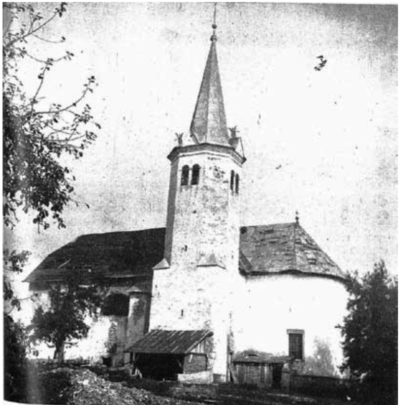
The Parish church of St. Margareth’s in Altlag, Gottschee. Photo taken in the 1930’s.

The Catholic church of St. Margareth’s, in the neighboring larger village of Altlag, served as the parish for Neulag as well. The assigned German priest made sure his parishioners’ faith and sacraments were maintained and recorded faithfully in the church’s familienbuch . It was his governmental duty to keep a diligent record of each house’s current and former residents in this family book. Births, deaths, marriages, and sacraments were all faithfully recorded as well. It was typical in German