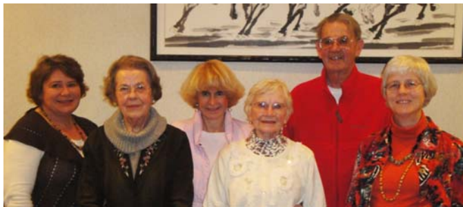
Branch 108 Installation of Officers

We met for a luncheon meeting in January for the Branch installation of officers, and planning events for the new year. Just before Easter we gathered to make butarice and to create pisanice (Slovenian colored eggs). This was a Branch family event that was enjoyed by all who were able to attend. Thanks to all our Branch members for assisting with supplies and delicious refreshments to be shared by all.