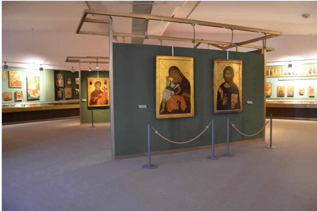
Photo 7: Collection of Orthodox Icons, Museum of Macedonia, Skopje, December 2013