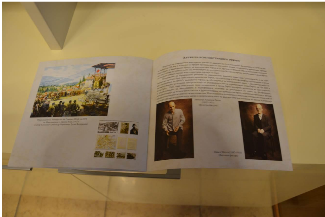
Photo 5: Section from the brochure titled: “Victims of the Communist regime”, Skopje, December 2013