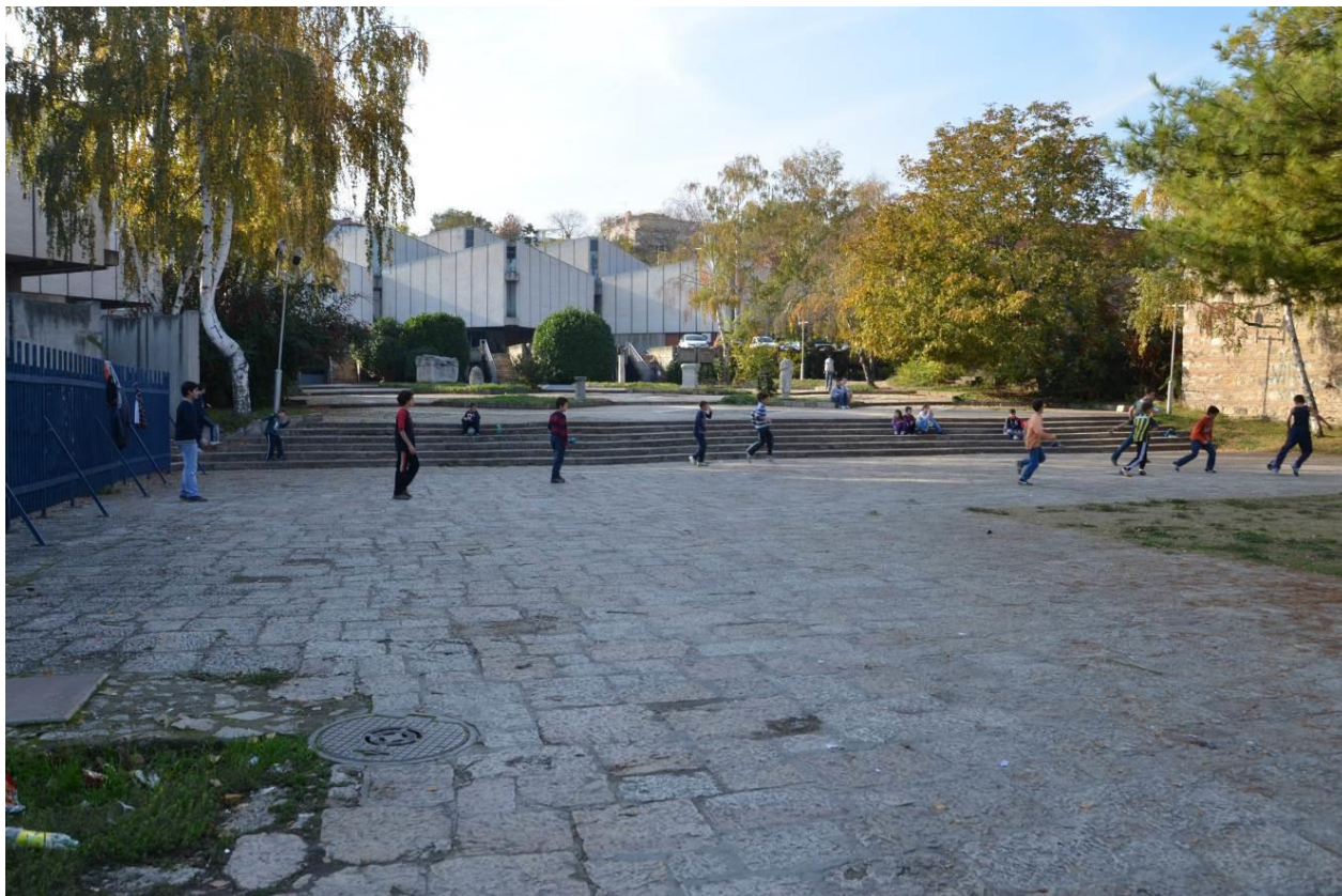
Photo 6: Entrance to the Museum of Macedonia, Skopje, December 2013