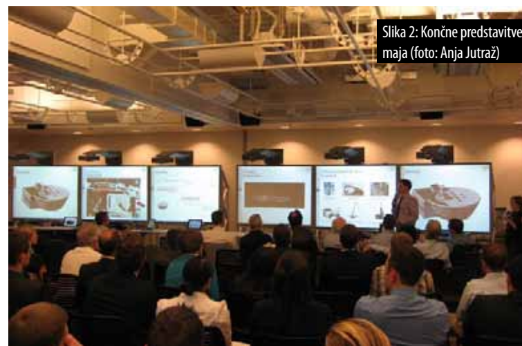
Slika 2: Končne predstavitev maja