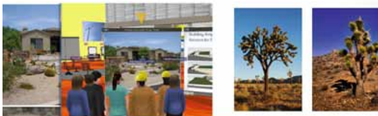
Slika 1: Prostorski prikaz.