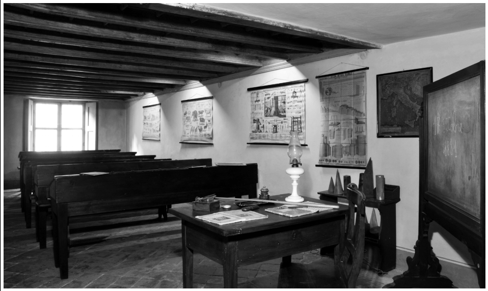
MUSLI - Museum of School and Children's Literature in Palazzo Barolo (Torino, Italy) http://www.operabarolo.it/it/p-60/palazzo-barolo/museo-della-scuola-e-del-libro-per-infanzia-musli (accessed 15.10.2019)

dedicated to music and science, great historical figures, authors, publishing houses and book series of Children's Literature), the Archive (which collects exercise-books, diaries, posters, school report cards, diplomas, essays, educational tools, educational games and other scholastic materials, sections dedicated to authors and illustrators for childhood, photographs, advertising etc.), the "Salgari Room" (which conserves original Italian editions and "historical" translations of the novels by Emilio Salgari and original tables) and the Museum have been started.