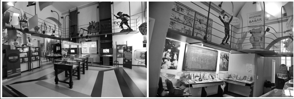
MUSLI - Museum of School and Children's Literature in Palazzo Barolo (Torino, Italy) http://www.operabarolo.it/it/p-60/palazzo-barolo/museo-della-scuola-e-del-libro-per-infanzia-musli (accessed 15.10.2019)

Museum Itinerary is the recreation of the typography in the classroom, according to the Freinet method, and the exposition of school newspapers; optically, in the end, the bond between school's history and book's history is symbolized by the ancient school desks, which in these rooms are destined to showcases, in an absolutely reversible way, showing the signs engraved by the students in the course of time too.