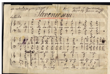
Originalno Slovenec sem note 1882

S ponosom reči smem: Slovenec sem, slovenec sem! S ponosom reči smem: Slovenec sem, slovenec sem! S ponosom reči smem: Slovenec sem, slovenec sem! S ponosom reči smem: Slovenec sem, slovenec sem!