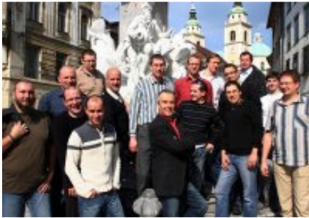
VAL - Vocal Academy of Ljubljana

The Vocal Academy of Ljubljana (VAL), a male choir from Slovenia, has won the European Grand Prix for Choral Singing 2010, the most prestigious award in choral singing. The choir led by Stojan Kure was selected out of six finalists in Bulgaria's Varna on Saturday evening in a competition that also featured non-European choirs.