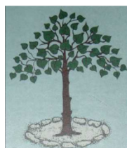
Symbolic Slovenian Lipa (Lime) tree.

(A reminder that the next general meeting for all members is on 8th August at 3.30pm. You are all warmly invited).