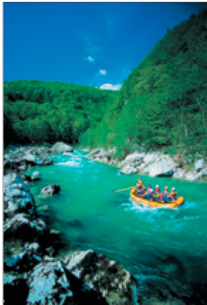
Rafting on the Soča river.

rafting. A visit to the Valley must encompass the sites which bear witness to the fierce fighting on the Isonzo Front during the First World War, which is also documented at the Kobarid Museum. Up in the mountains, numerous strongholds, pillboxes and trenches have survived. Visitors seeking to know more about this historic battleground can visit the spectacular Kluže Fortress or take a tour of privately owned weapons collections. On the right bank of the Soča, near Nova Gorica lies a wine producing area known as Goriška Brda, a hilly and green land to the west of the Italian town of Gorizia, which at its