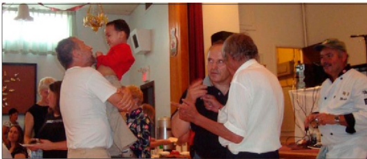
Visiting Students from Slovenia