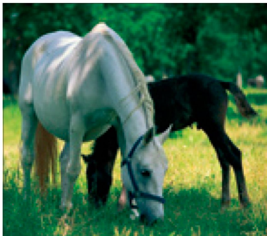
Lipicanci are Slovenian species of riding horse of world-wide renown, originating in the village of Lipica. When young, these horses are either black or grey and when they grow up, most become white.

wild animals. The most important site in the region is the Romanesque church of the Holy Trinity in the village of Hrastovlje. The church dates back to the early 12th century and is famous for its wall frescoes, especially the depiction of the Dance of Death. Besides scenic stone villages, there are three famous ancient coastal towns in the region: Koper, Izola and Piran. Also of importance is the seaside resort of Portorož, with its lively tourist industry, which began in the early 1900's. The town of Koper has an important commercial port, Luka Koper. In 2003, Koper also became a university town. It is also the home of the successful Cimos d.d. Automobile Industry Company, which makes parts for international car manufacturers.