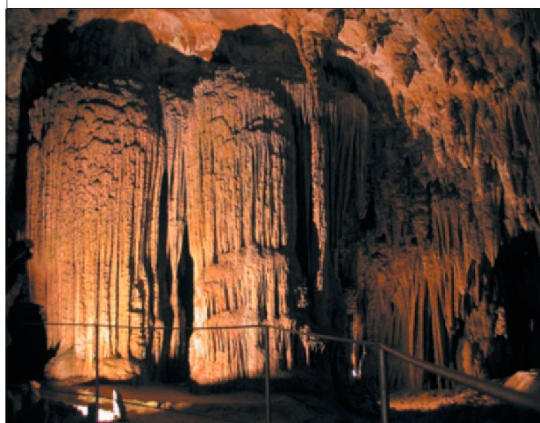
The Škocjan Caves, a UNESCO World Heritage site since 1986.