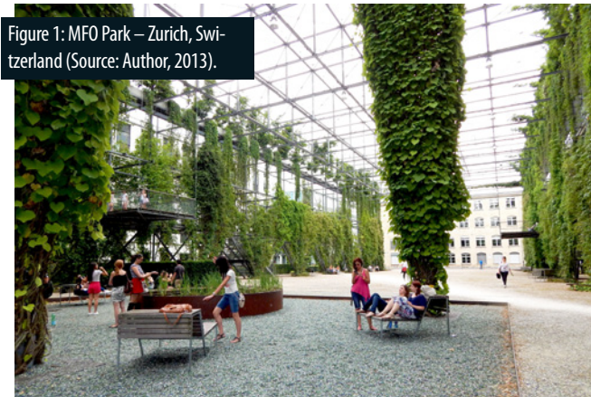
Figure 1: MFO Park – Zurich, Switzerland (Source: Author, 2013).