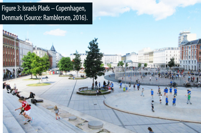
Figure 3: Israels Plads – Copenhagen, Denmark.

As the world is constantly changing, every discipline also faces changes in its domain. Ancient architecture has formed spaces that indicated encountered participation, where we understand ourselves through others, enabling human freedom and bodily communication (Pérez-Gómez, 2017). Modern urbanism has significantly put low importance on the idea of city space as a meeting place for people, the overall public space, and the walking experience in it (Gehl, 2010, p. 3). Nowadays, the situation is different. Private interests are escalating, technology