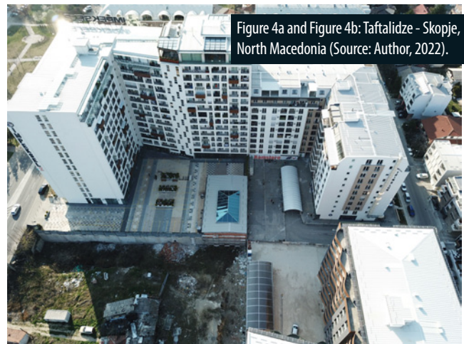
Figure 4a and Figure 4b: Taftalidze - Skopje, North Macedonia.

reshapes the real world into the virtual, and the economic and political domain is skeptical about the symbolic values of the space (Pérez-Gómez, 2017). Lawrence Herzog (2006, p. 5) argues about the current situation in Mexico, where the public space is gradually reshaping into something unrecognizable and unmeaningful. Transitional countries are additionally facing the issue of shrinkage or unactive public spaces. It seems like we are losing the focus of quality over quantity, compromising some of our basic spatial needs just for short-lasting benefits. For example, in North Macedonia, with its capital city of Skopje, most of the public spaces within collective housing buildings are not in their intended function. They are not properly designed and managed, and they seem like they don't serve at all for a collective urban living ( Figure 4 and Figure 5 ). The human presence is missing, and what dominates is