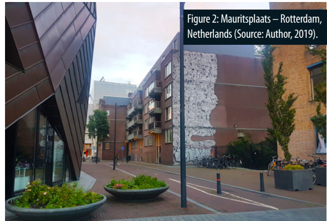
Figure 2: Mauritsplaats – Rotterdam, Netherlands (Source: Author, 2019).