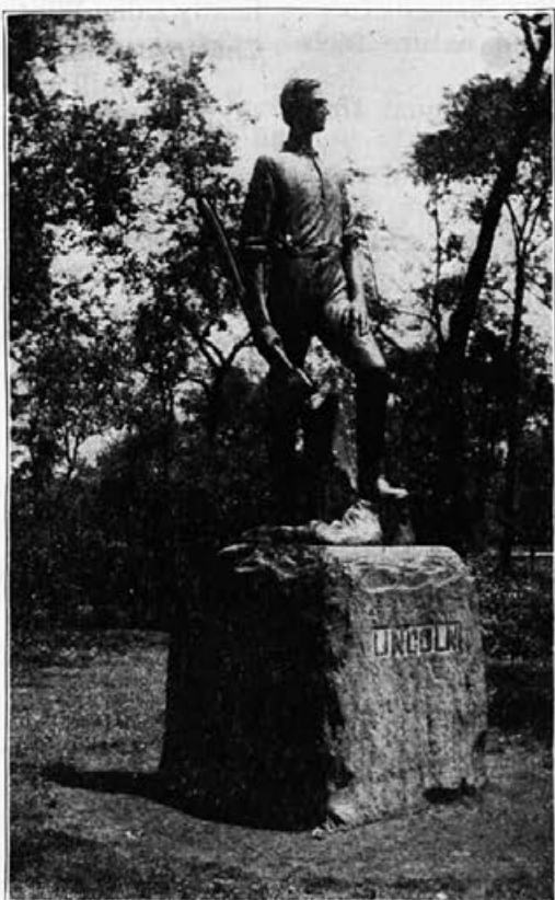
LINCOLN AS A YOUTHFUL RAIL-SPLITTER